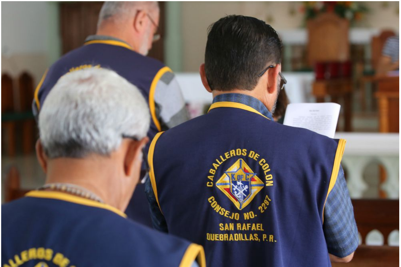
Members of the Knights of Columbus pray during Mass Oct. 22, 2017, at St. Rafael the Archangel Church in Quebradillas, Puerto Rico.

Consequently, he ordered that UKnight "is entitled to the July 1, 2017 'Council Statement - Summary and Payment Coupon' " that was issued to each council. Currently, according to the Knights, more than 15,000 local councils, with a membership of 1.9 million, exist in the United States, Canada, the Philippines, Mexico, Poland, Dominican Republic, Puerto Rico, Panama, Bahamas, Virgin Islands, Cuba, Guatemala, Guam, Saipan, Lithuania, Ukraine and South Korea. Insurance is sold in the United States, Canada, Puerto Rico and Guam.