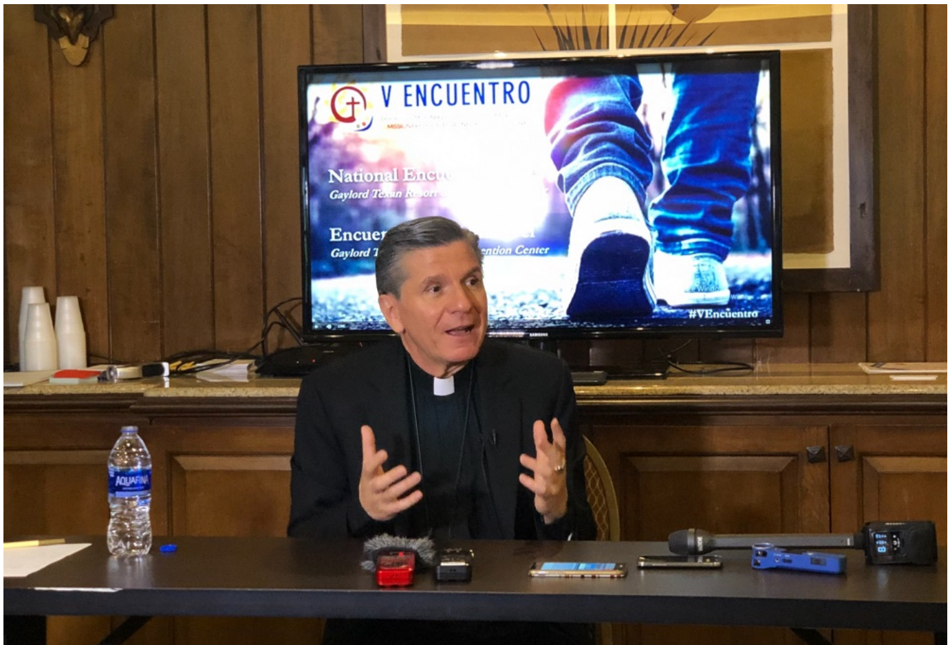
Archbishop Gustavo García-Siller speaks with the media Sept. 21 in Grapevine, Texas during the National V Encuentro.

García-Siller noted that the group of young people he dined with already disrupted the stereotypes he might have had.