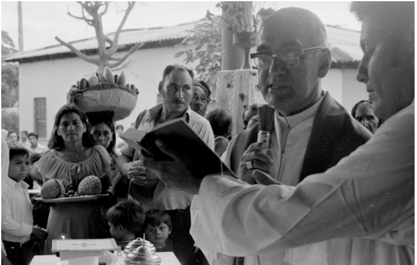
Archbishop Óscar Romero presides at a confirmation Mass in Ateos in San Salvador, El Salvador, September 1979.

Nor did Francis stop there; he did something else that had long cried out to be done. Many people aren't aware — but Francis was — of how shabbily Romero was treated by all but one of his brother bishops. Seldom has there been a condemnation of bishops as strong as the one Francis expressed to a group of Salvadoran pilgrims who were visiting the Vatican in 2015: