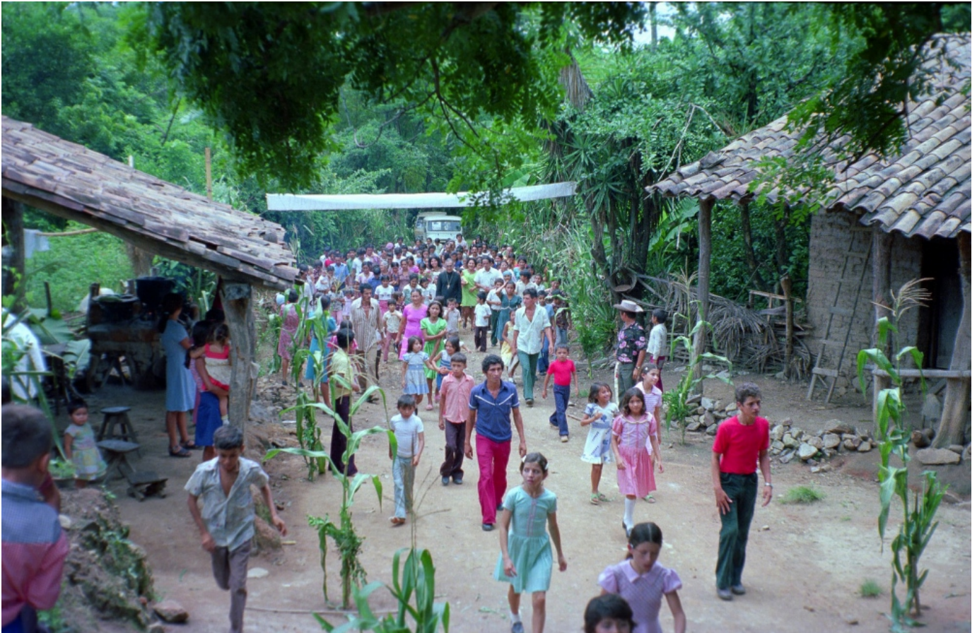
A crowd of people from San Antonio Los Ranchos in Chalatenango, El Salvador, walk with Archbishop Ã?scar Romero as he arrives to celebrate Mass in 1979.

I came from. I started creating another world. When I went back to El Salvador, they made me the bishop's secretary in San Miguel. I was a parish priest there for 23 years, but I was still buried in paperwork â?¡ Then they sent me to Santiago de MarÃ?a, and I ran into extreme poverty again. Those children that were dying just because of the water they were drinking, those campesinos killing themselves in the harvests â?¡ You know, Father, when a piece of charcoal has already been lit once, you don't have to blow on it much to get it to flame up again â?¡ So yes, I changed. But I also came back home again."