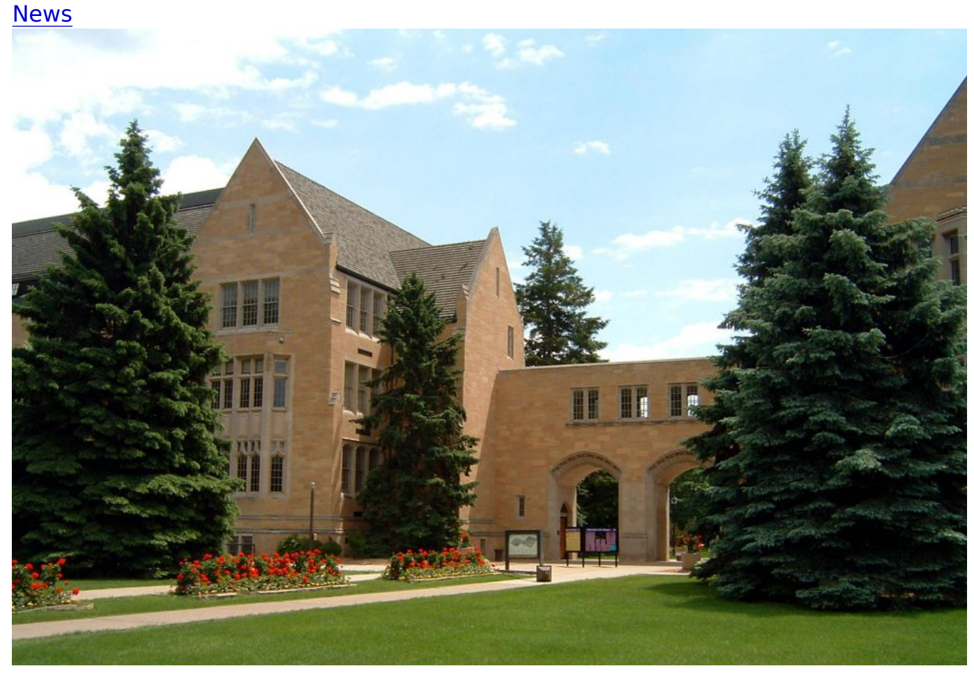
University of St. Thomas campus, St. Paul, Minnesota, 2005