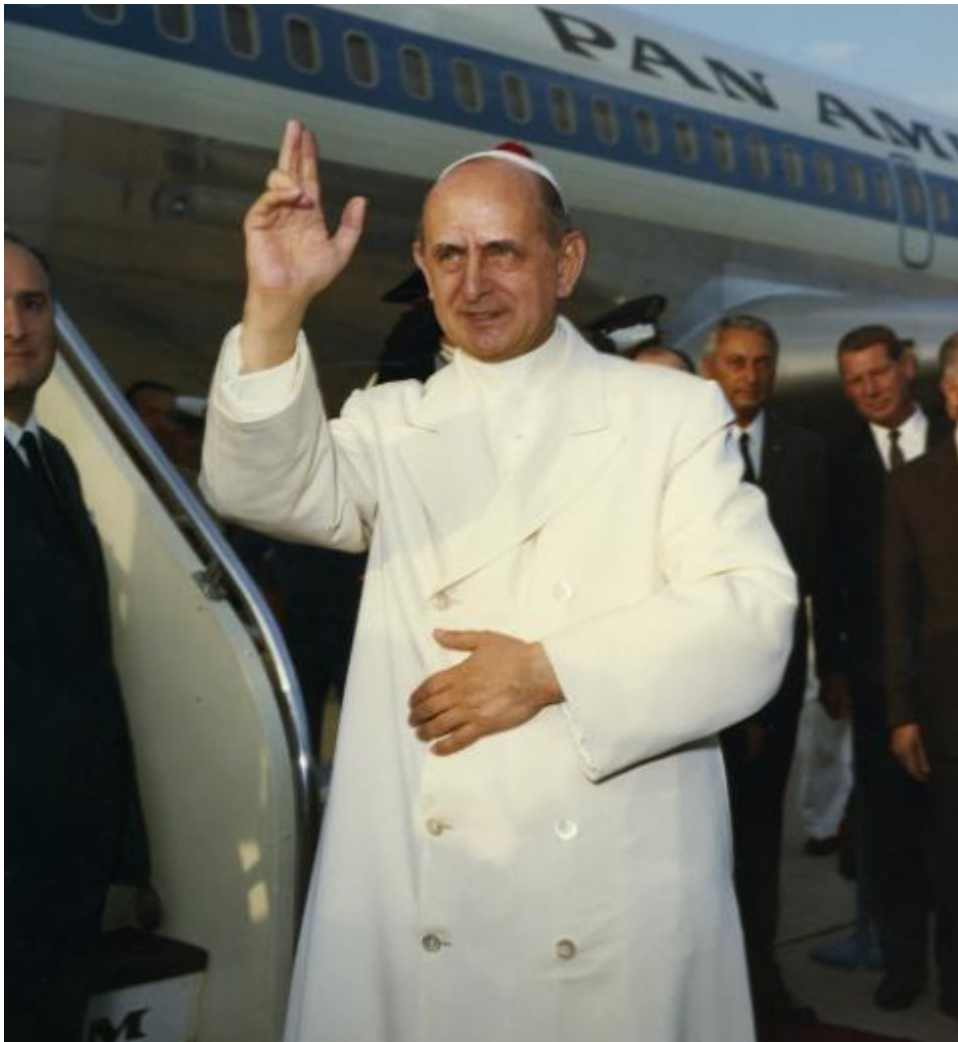
Pope Paul VI offers a blessing at Rome's airport before a flight to Istanbul in 1967.

My initial column on the New York visit, as memory serves, went (in those pre-PC days) something like this: