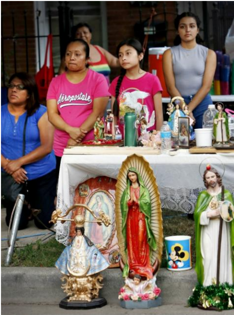
Worshippers pray during a street Mass held by St. Agnes of Bohemia Parish in the Little Village neighborhood of Chicago July 18, 2017.

Meanwhile, English speakers "view faith through a different lens and a lack of trust of a person or an institution leads to a lack of faith or trust in God."