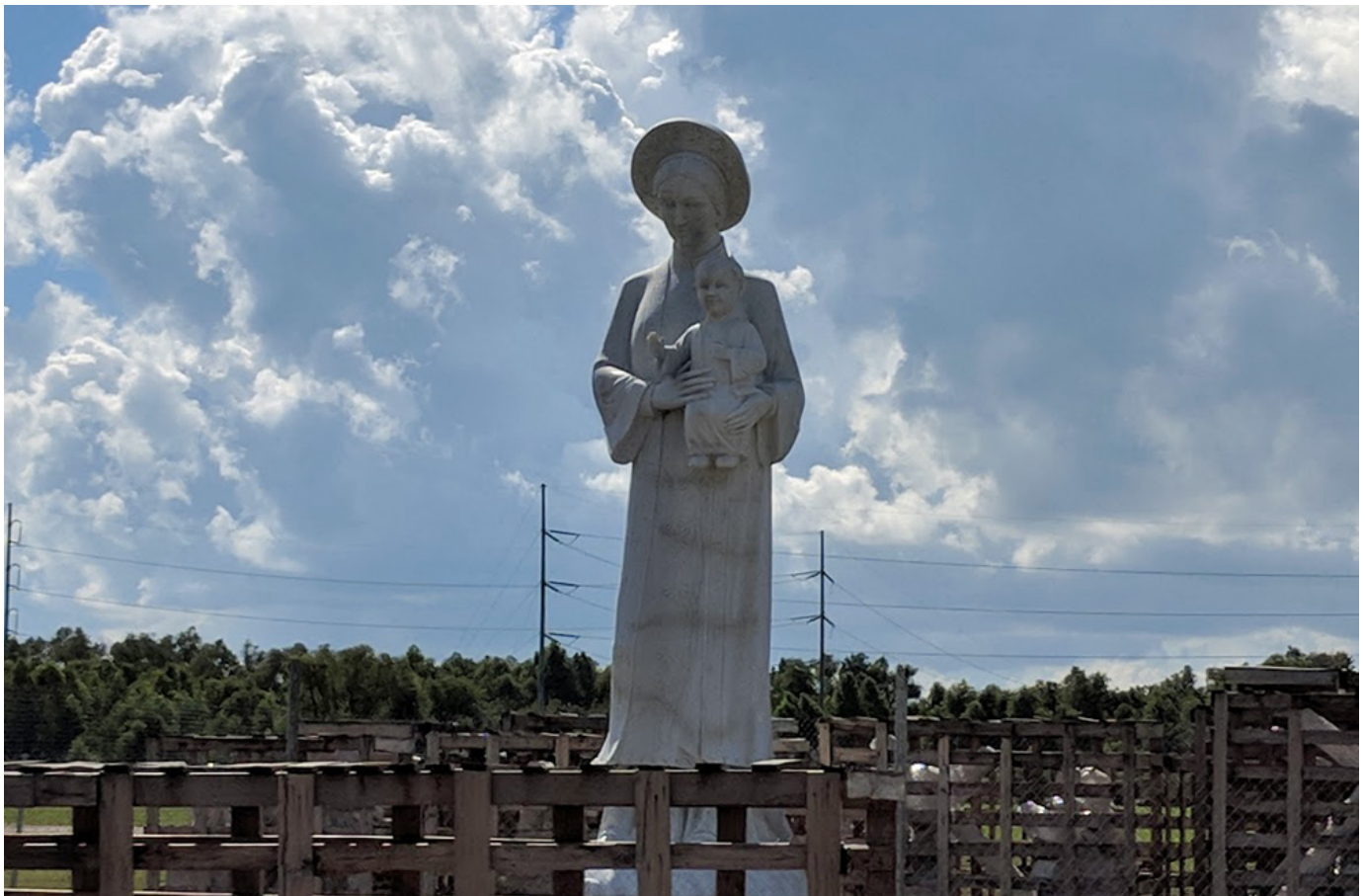
The statue of Our Lady of La Vang in New Orleans

The statue was carved from one piece of solid marble in Vietnam and then shipped to New Orleans this summer, he said, adding that the statue will be placed on an 11-foot foundation. A park will be developed around the statue in the coming year.