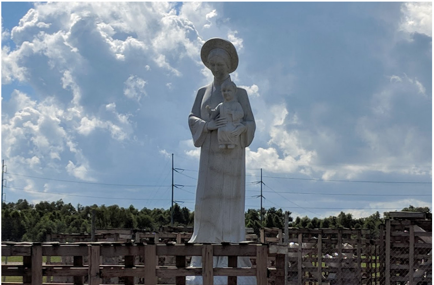
The statue of Our Lady of La Vang in New Orleans

The statue was carved from one piece of solid marble in Vietnam and then shipped to New Orleans this summer, he said, adding that the statue will be placed on an 11-foot foundation. A park will be developed around the statue in the coming year.