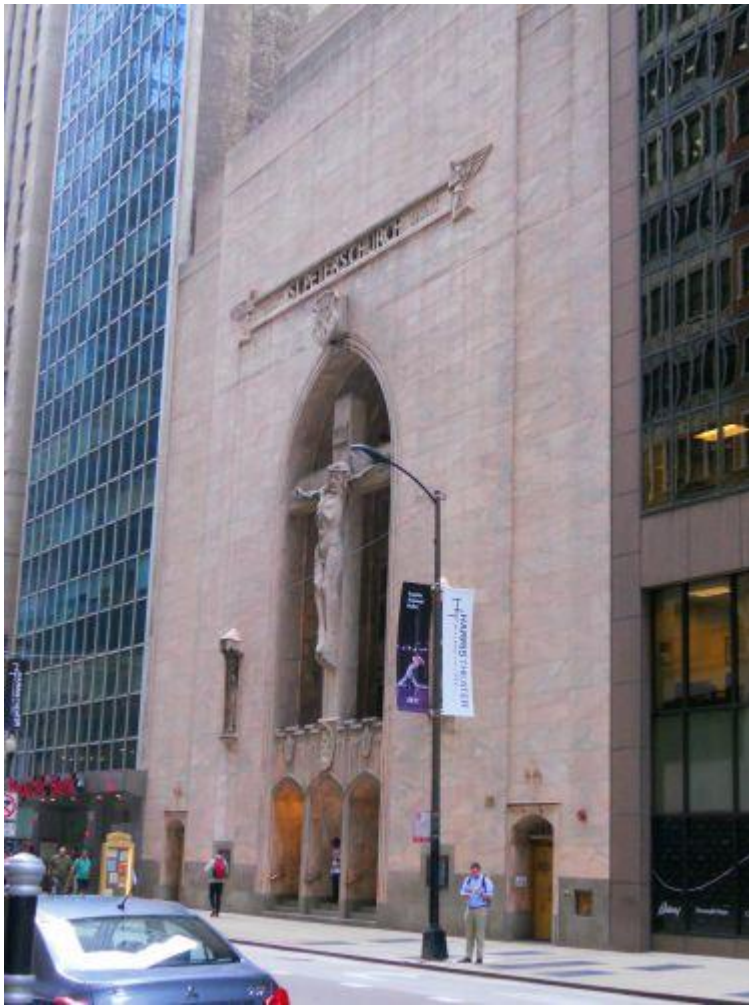
St. Peter's Franciscan Church in the Loop.