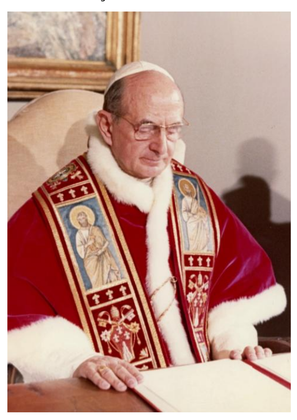
Pope Paul VI at the Vatican on June 29, 1968

The poem is, of course, a metaphor, and the destruction of the one-horse carriage Holmes is describing represents the sudden destruction of Calvinism as the essential cultural framework for New England society. After the antebellum division of "First Parish" churches into Congregationalist or Unitarian congregations, and the loss of orthodoxy at Harvard, New Englanders awoke to the realization they were now Yankees and no longer Puritans.