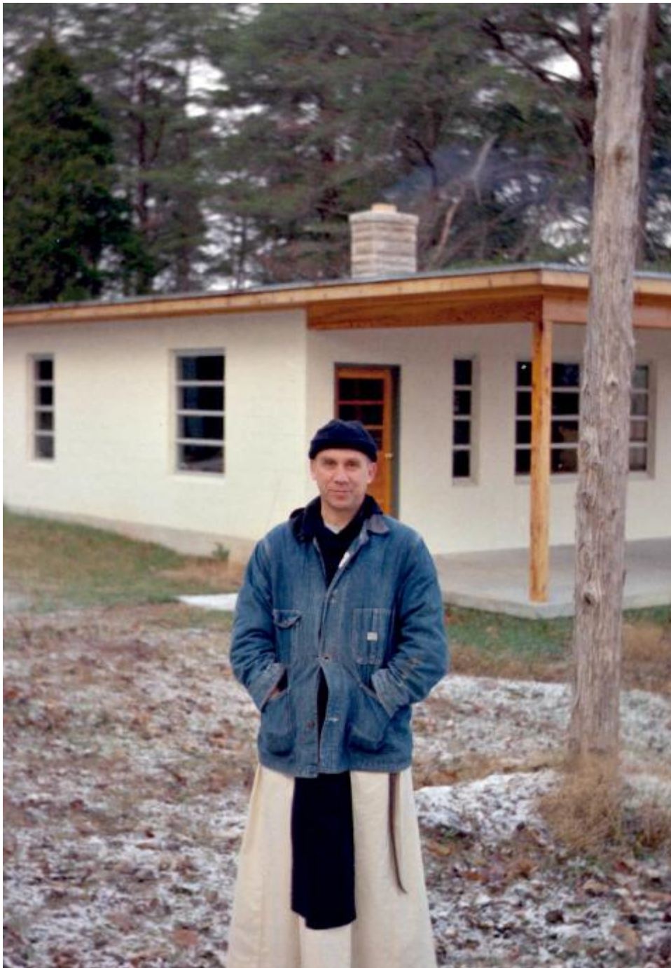
Trappist Fr. Thomas Merton in an updated photo at the hermitage at Gethsemani Abbey

Titled "Disappear From View?: Thomas Merton Fifty Years Later, and Beyond," the gathering kicks off Friday evening with a keynote by Franciscan Fr. Richard Rohr — whom some see as a spiritual successor to Merton — and continues with a daylong schedule of talks, panels and Mass on Saturday. (The keynote's registrations are