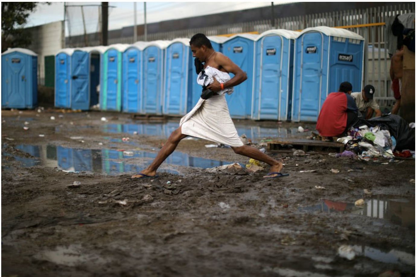
A migrant who is part of a caravan of thousands from Central America trying to reach the United States steps across mud after taking a shower Nov. 28 at a temporary camp in Tijuana, Mexico.

President Donald Trump has made it clear that he doesn't want caravan members to enter the U.S. in any way and has demanded that countries they pass through halt the group. Although this didn't stop thousands of migrants from reaching the U.S. border, many did turn back or decide to apply for asylum in Mexico instead of continuing to the U.S.