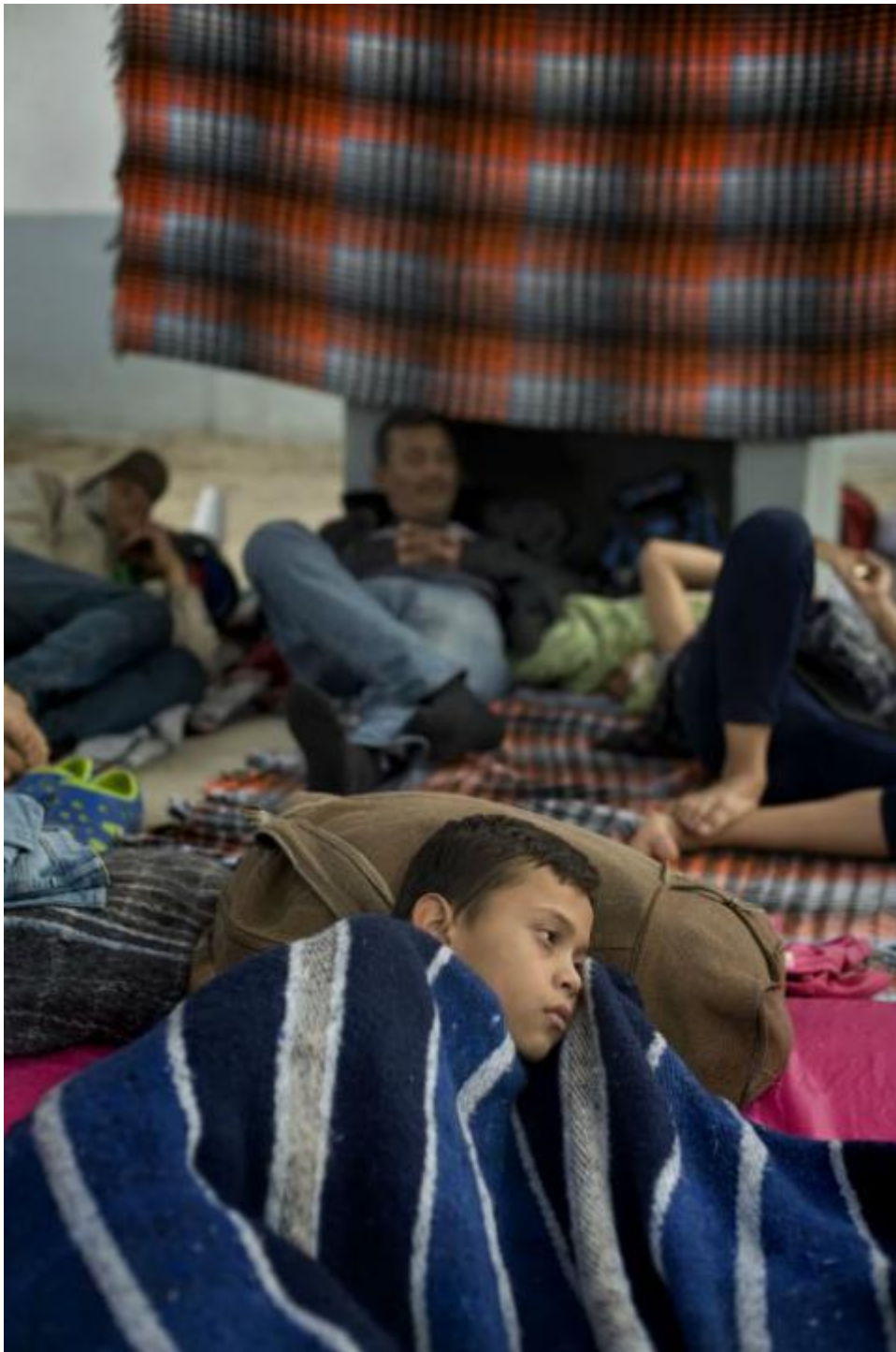
A boy rests at a shelter at a sports facility in Tijuana, Mexico, set up to for people arriving Nov. 15 in a caravan of Central American migrants at the U.S.-Mexico border. The shelter opened the previous night and had more than 750 people, but dozens more lined up outside waiting to enter.