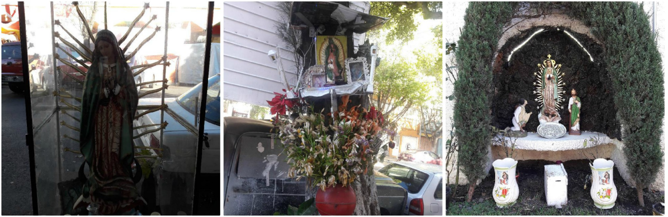
Various private shrines to Our Lady of Guadalupe