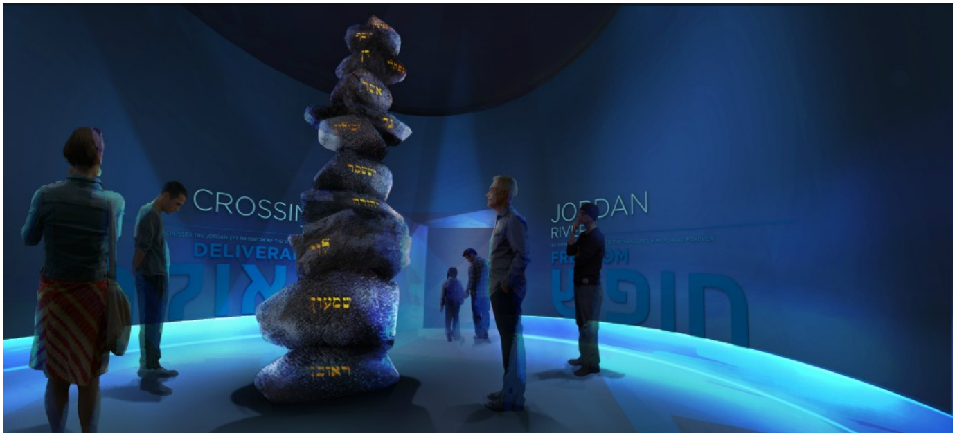
An exhibit at the Museum of the Bible tells the story of crossing the Jordan.

Barush suggested that the appeal of biblical tourist attractions could have something in common with the grassroots projects she recently researched — such as a man who walked the Camino de Santiago in his backyard — and even with traditional Catholic devotions.