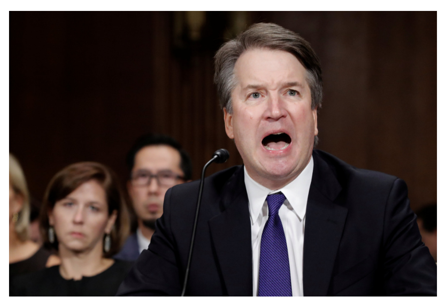
U.S. Supreme Court nominee Judge Brett Kavanaugh testifies before a Sept. 27 Senate Judiciary Committee hearing on Capitol Hill in Washington. Kavanaugh followed Professor Christine Blasey Ford, who testified about her accusation that he sexually assaulted her in 1982, a claim he vehemently denied.

The Senate confirmed Kavanaugh as a Supreme Court justice in a 50-48 vote Oct. 6, days after the Supreme Court had resumed its new term.