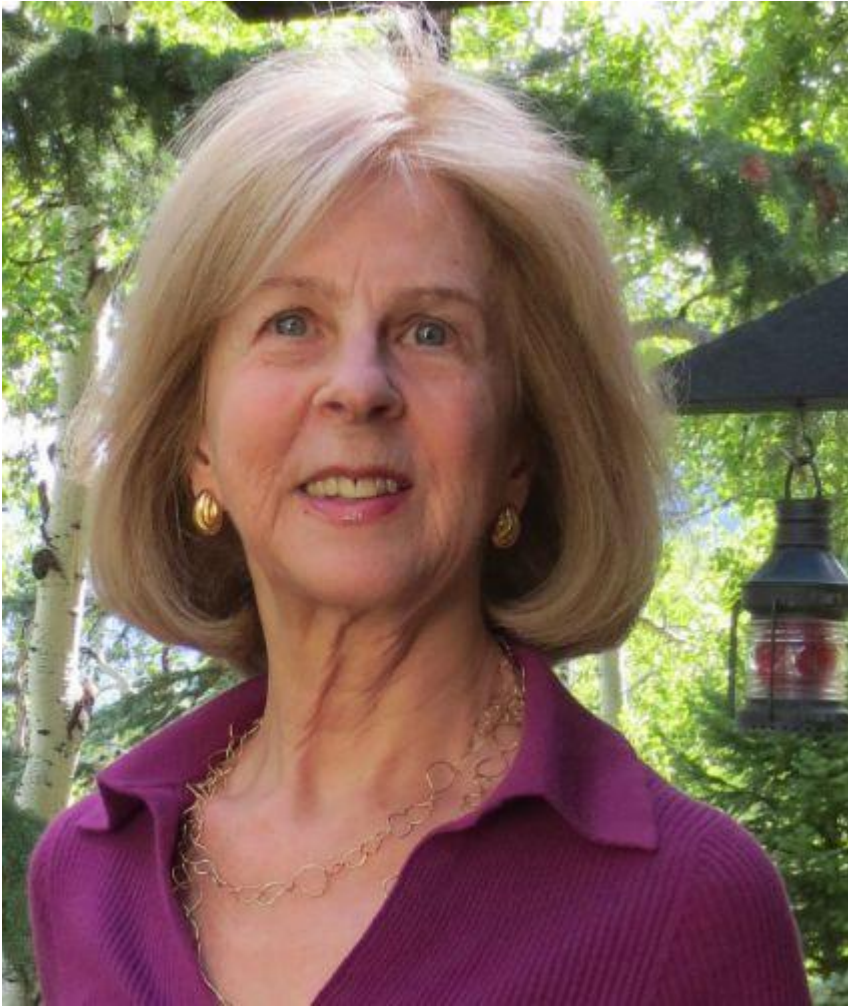
Elaine Pagels

day? What do these stories mean to them?"