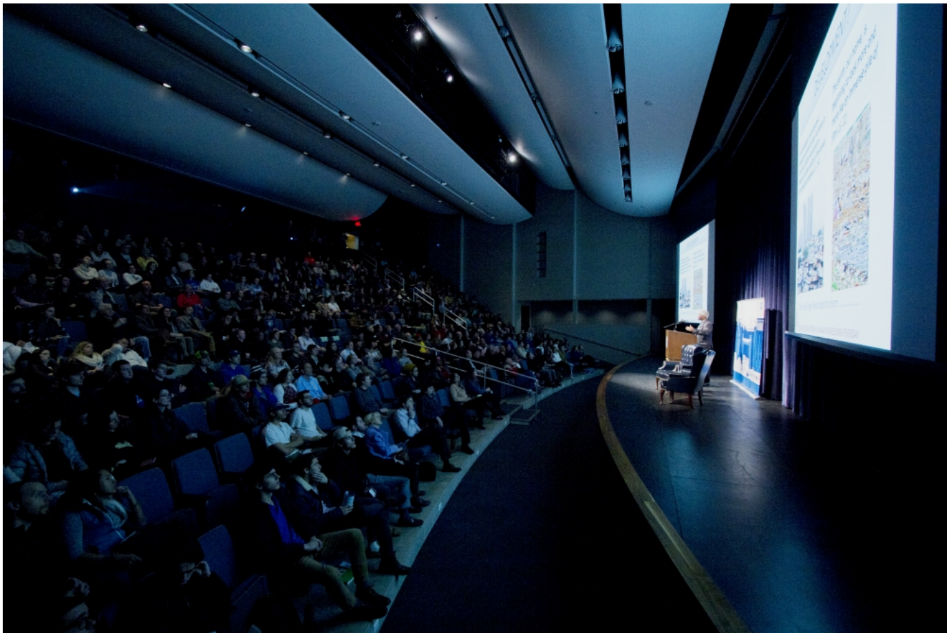
Approximately 500 people attend Cardinal Peter Turkson's speech on refugees Jan. 17 at Rockhurst University in Kansas City, Missouri.

"Our help should not be based on superfluity. Our help should rather be based on the need to imitate God's charity," he said.