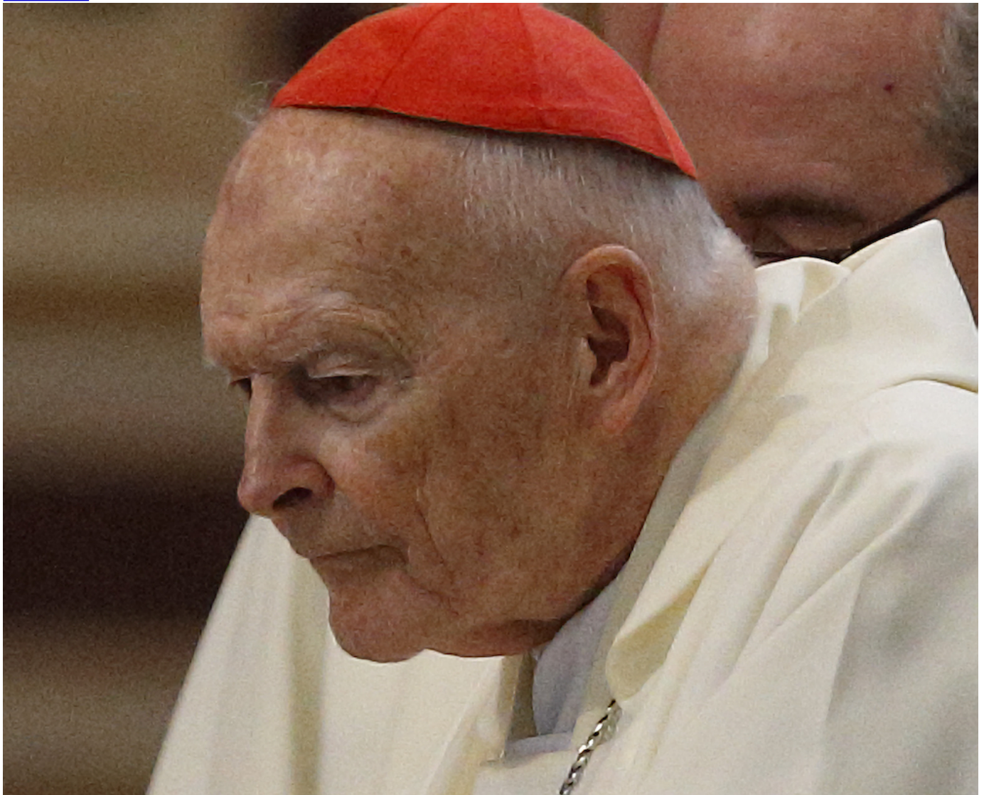
Then-Cardinal Theodore E. McCarrick attends a Mass in Rome April 13, 2018.