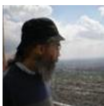
by Gabe Huck