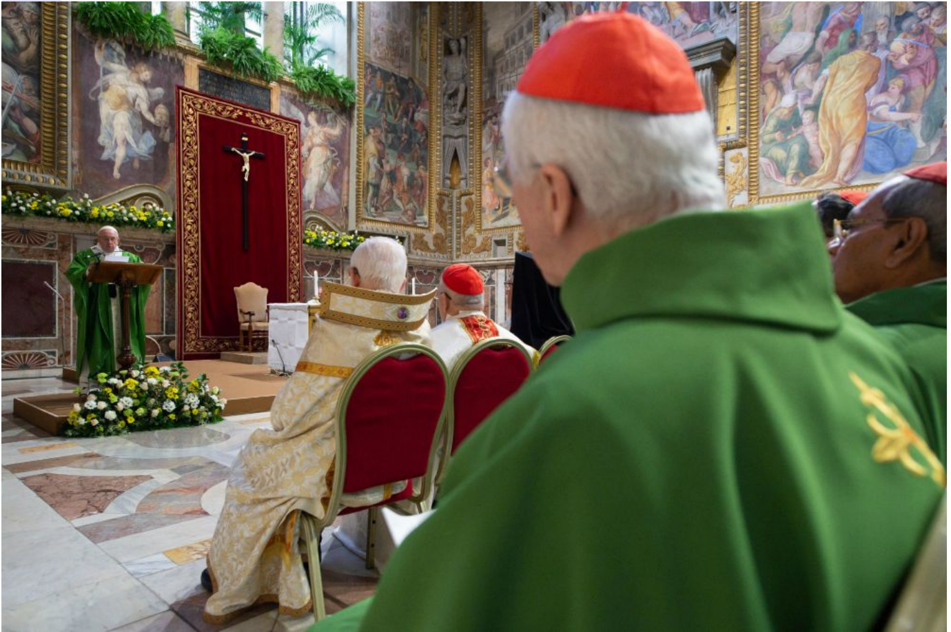
Pope Francis speaks at the conclusion of a Mass on the final day of a meeting on the protection of minors in the church at the Vatican Feb. 24.