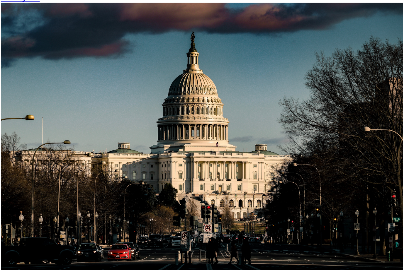
The United States Capitol in Washington, D.C.