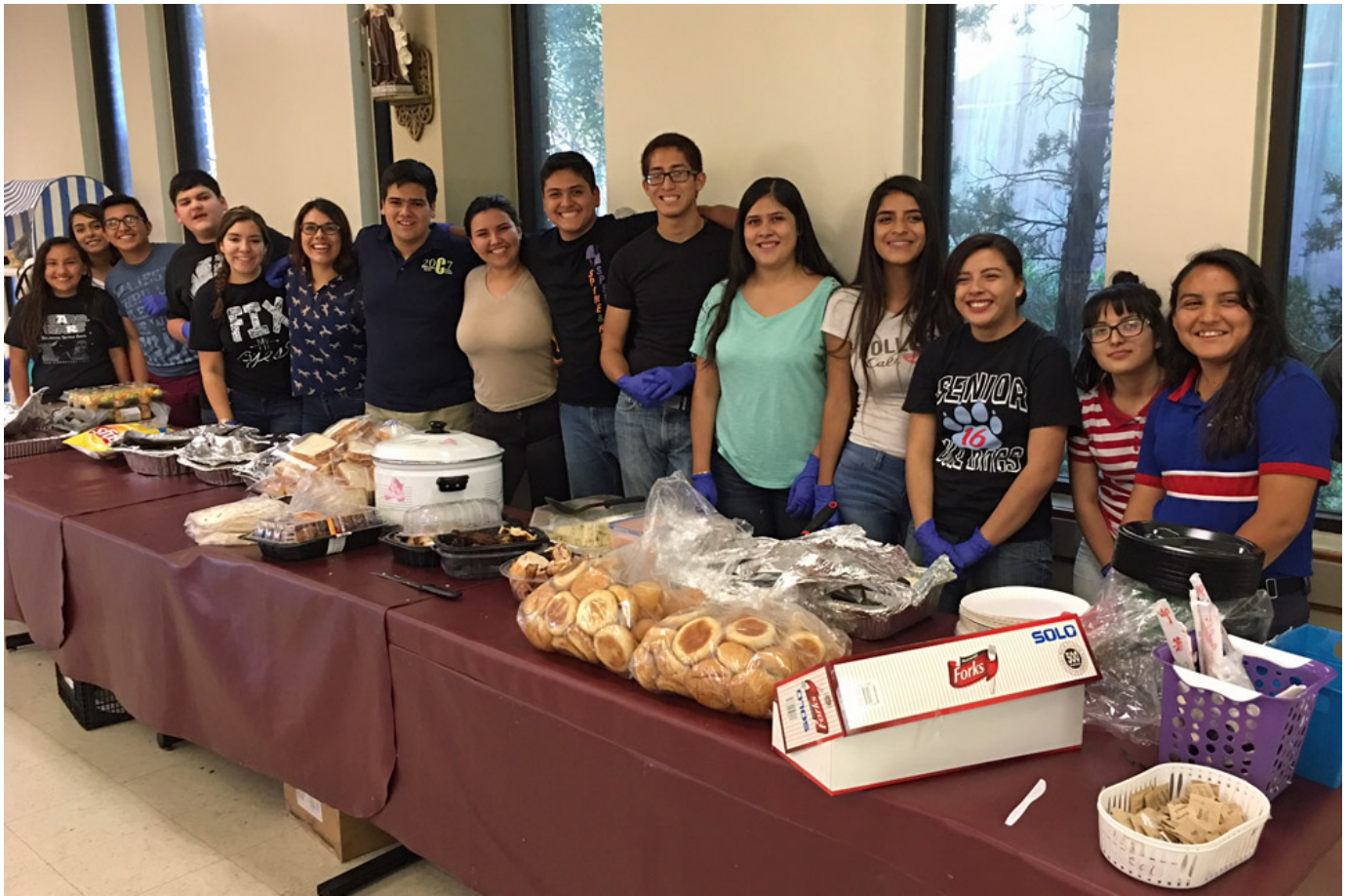
A group of youth from an El Paso parish poses before serving dinner they prepared for migrant families.