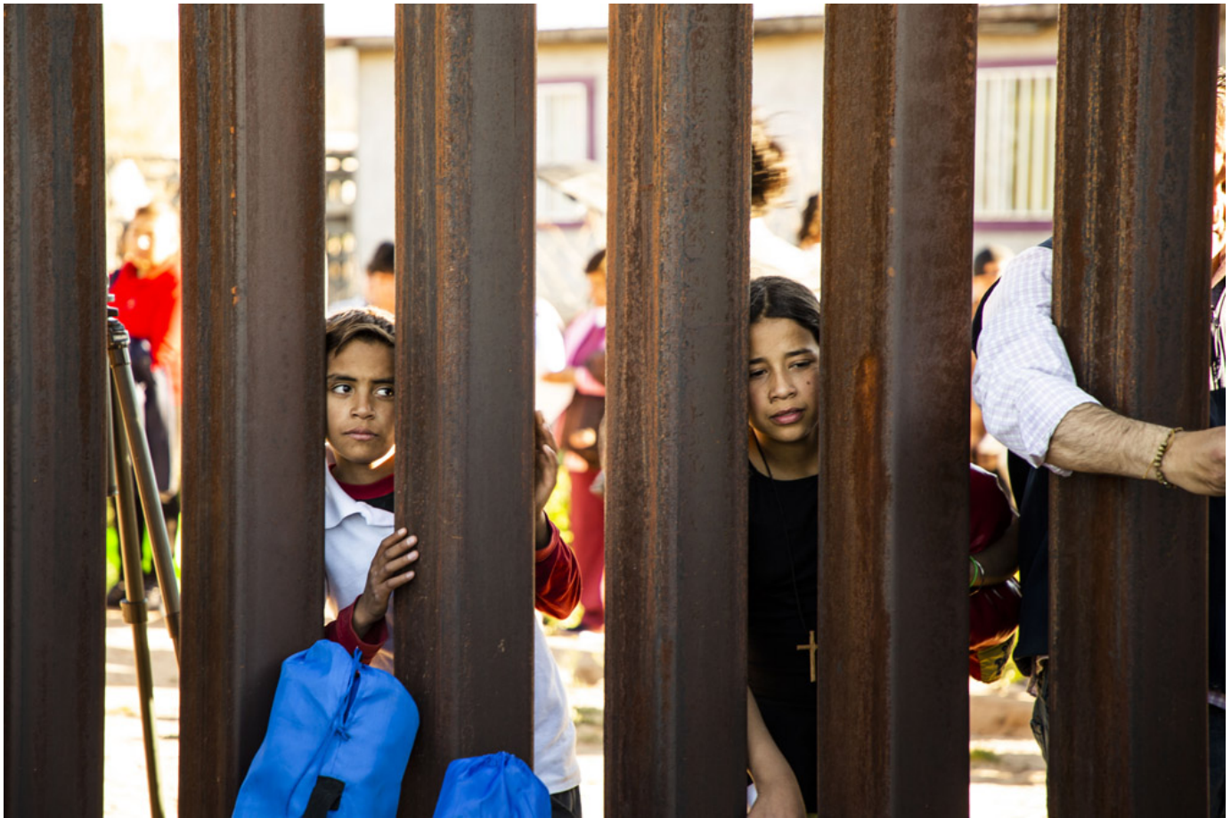
Curious children peek through the Anapra border fence.

Many of the laity at the Anapra event, myself included, are already responding "on the ground," devoting long hours to care for the growing needs of immigrant families. Dozens of temporary hospitality centers have cropped up throughout the area known as the borderlands, from east El Paso to southern New Mexico.