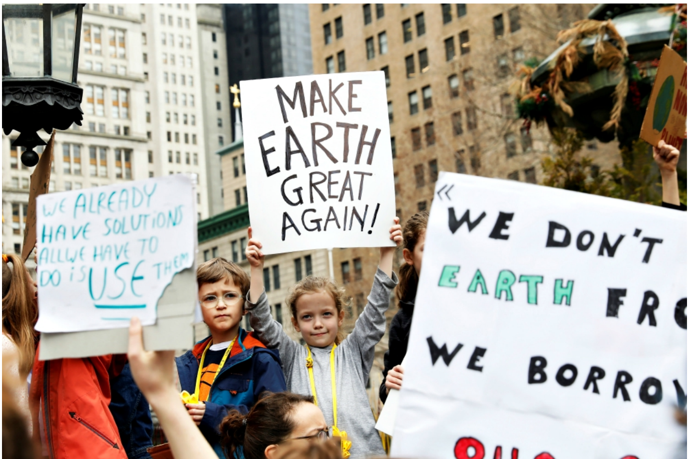
Students hold signs in New York City March 15 to demand action on climate change. Students from around the world participated in the "strike."

President Donald Trump has stated he will withdraw the United States from the Paris Agreement at the earliest date — Nov. 4, 2020, a day after the next presidential election — which would place the greatest contributor to historical carbon emissions out of step with the rest of the world. The rise in nationalist sentiments has led other countries, like Brazil, to question their commitments to reducing emissions while doubling down on drilling, mining and logging.