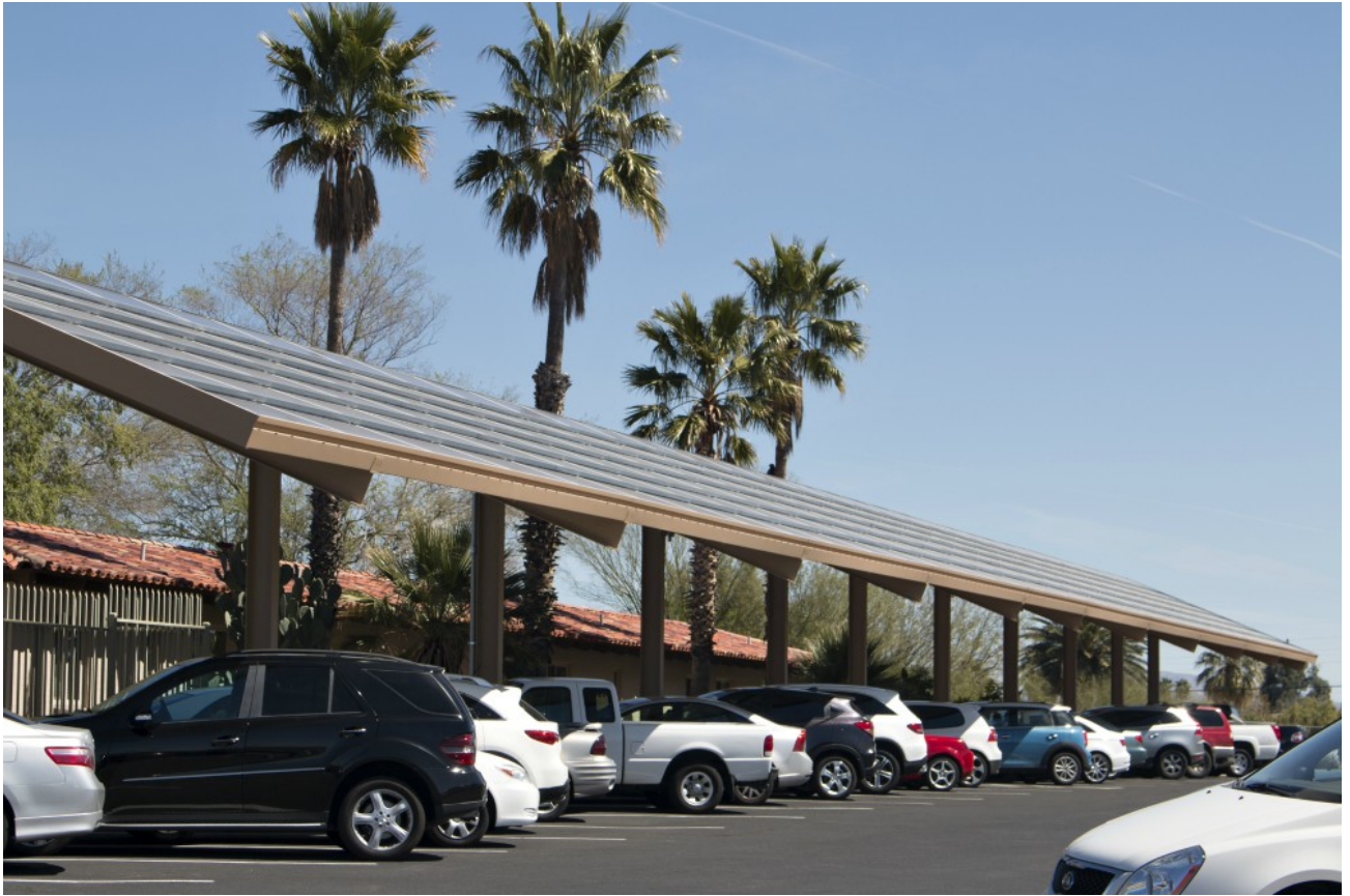
Solar panels reside on a parking canopy at the Carmelite residence near Salpointe High School in Tucson, Arizona.