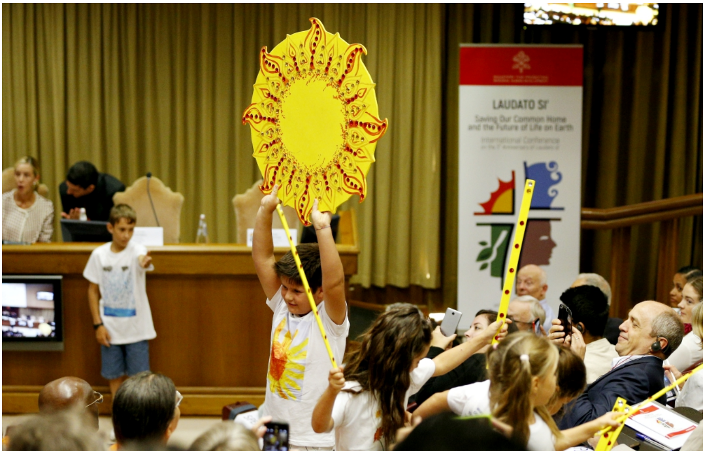
A boy holds up artwork of the sun as children perform at the start of an international conference marking the third anniversary of Pope Francis' encyclical "Laudato Si", on