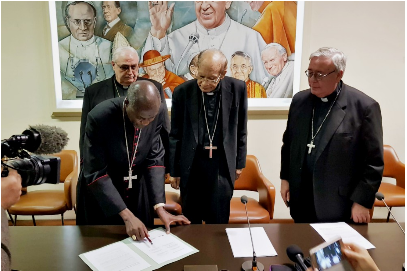
Cardinals and archbishops sign a joint statement at the Vatican Oct. 26, 2018, calling on the international community to take action against climate change.