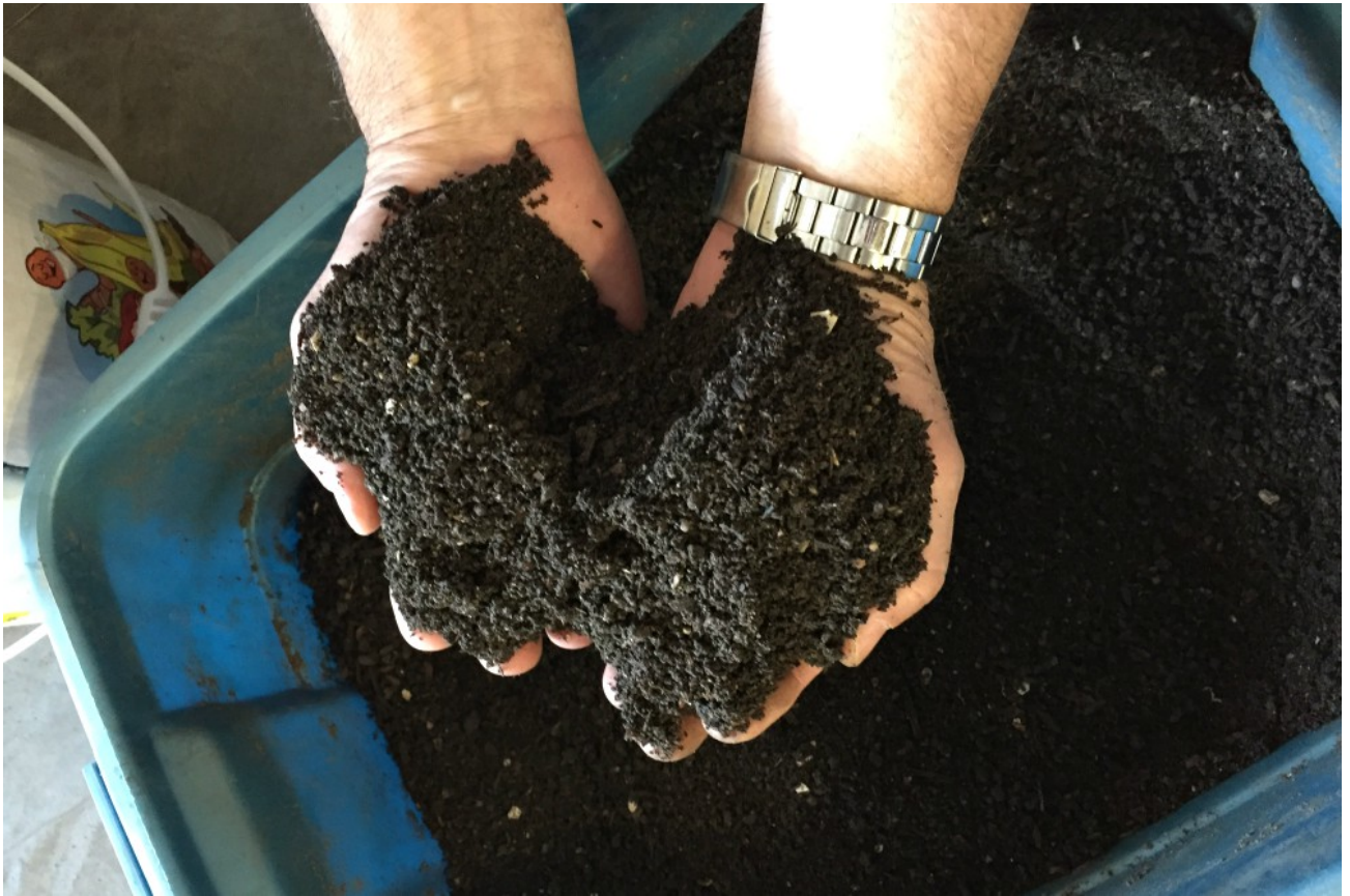
Compost is seen on the campus of the University of Dayton in Ohio.