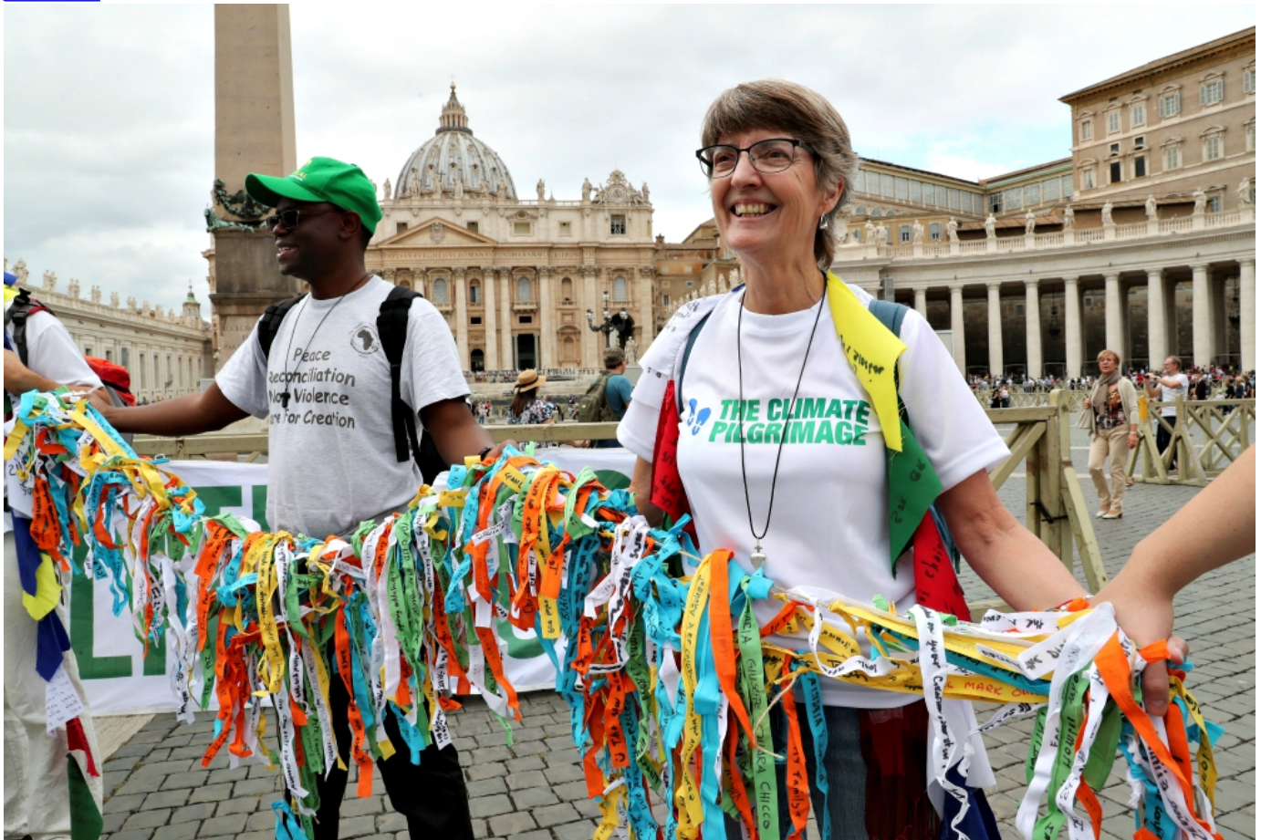
Pilgrims of Catholic environmental movements are seen Oct. 4, 2018, at the start of the climate walk in St. Peter's Square at the Vatican.