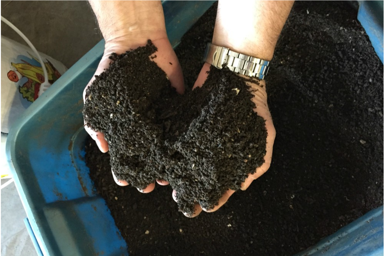
Compost is seen on the campus of the University of Dayton in Ohio.