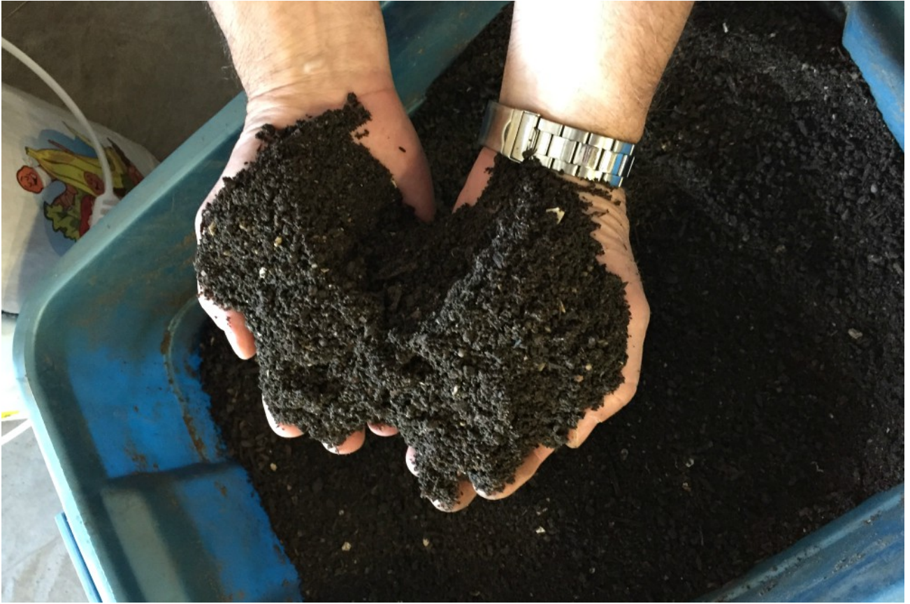
Compost is seen on the campus of the University of Dayton in Ohio.