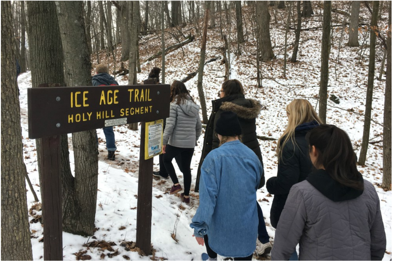
Students from St. Catherine of Alexandria High School hike through Wisconsin's Kettle Moraine region during a 2018 retreat run by the Laudato Si' Project.