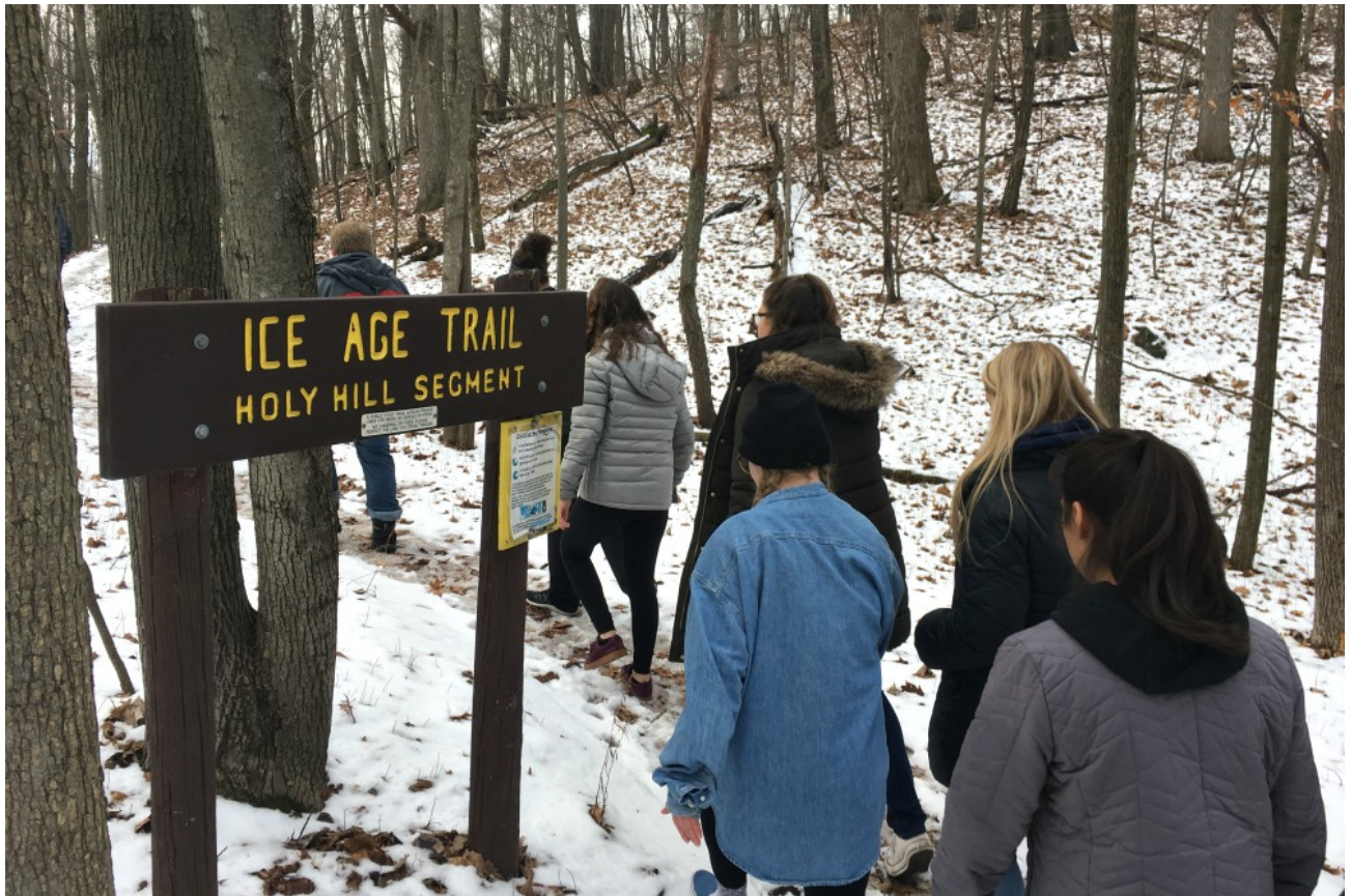
Students from St. Catherine of Alexandria High School hike through Wisconsin's Kettle Moraine region during a 2018 retreat run by the Laudato Si' Project.