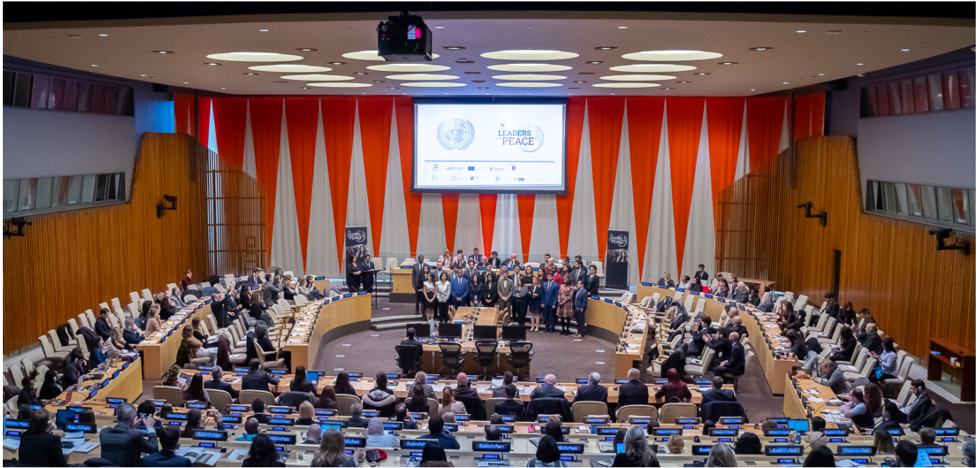
A group photo of the students from Rondine during the launch of their initiative at the United Nations building in New York.

dialogue rooted in the encounters of daily living. Indeed, what makes Rondine's peace-building efforts a recipe for success in local and international relations is their invitation to embrace convivenza , an intentional commitment to a culture of encounter lived daily by coming together with others and their distinct differences for the sake of building the common good. These young ambassadors have much to teach us about tearing down ideological "walls" that divide and polarize us.