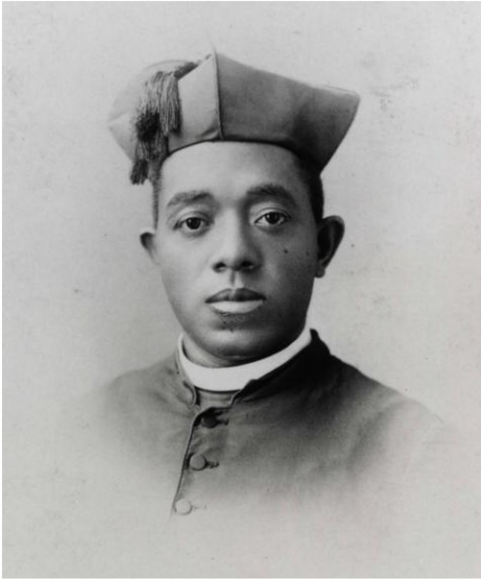
Fr. Augustus Tolton