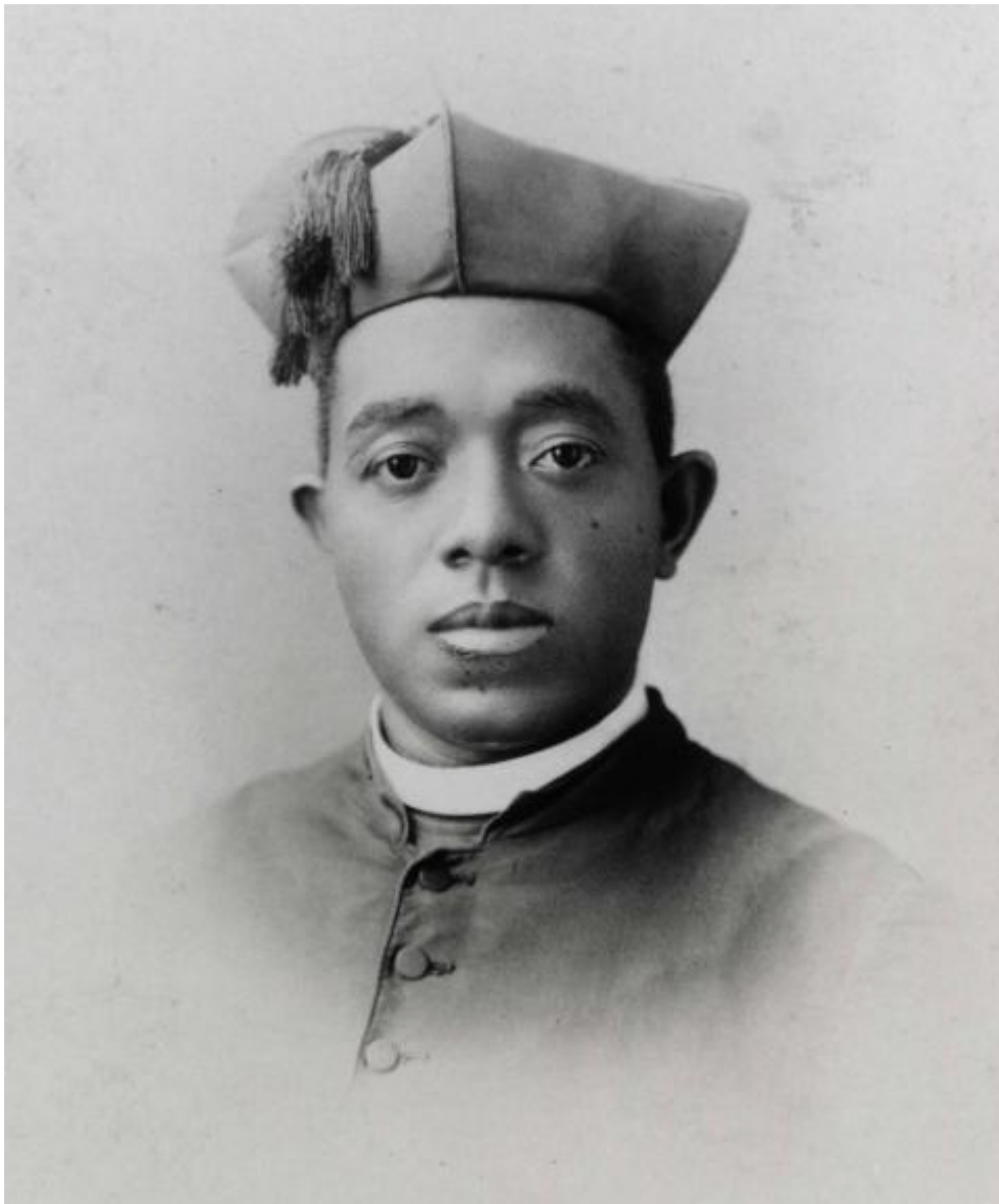
Fr. Augustus Tolton