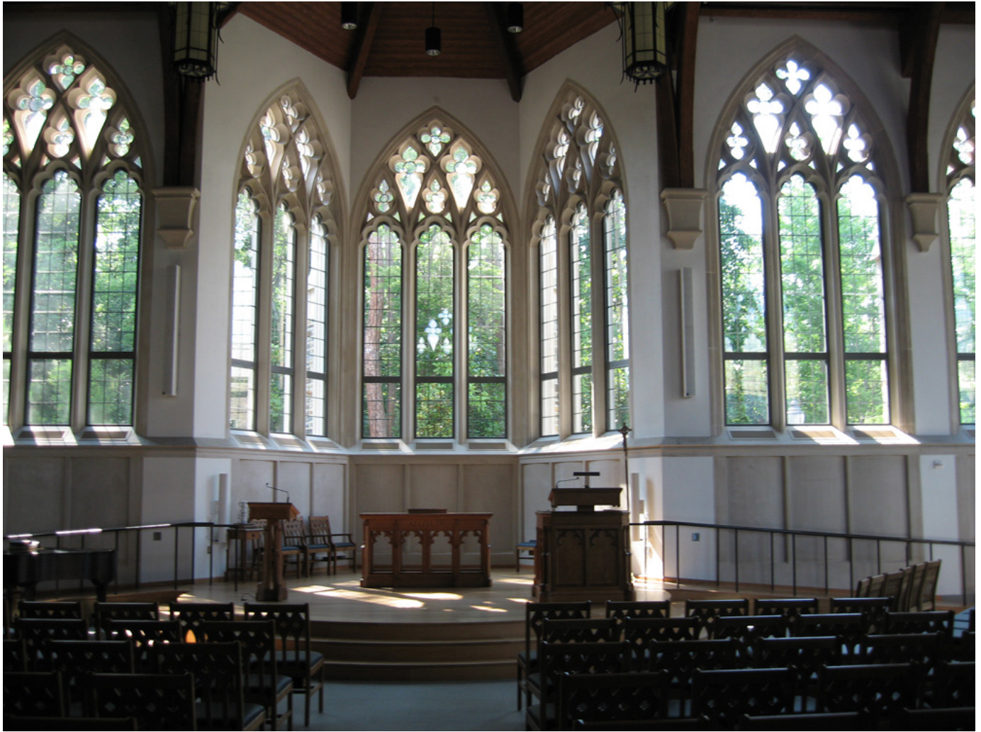
The interior of Goodson Chapel at the Duke Divinity School (Creative Commons)