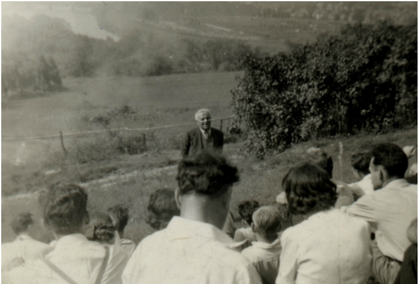
Peter Maurin speaks at a retreat at the Catholic Worker Maryfarm in Easton, Pennsylvania, in September 1940.