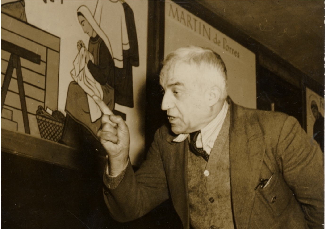
Peter Maurin in the 1930s

While he outlined a three-point program of action — roundtable discussions for "the clarification of thought," houses of hospitality where the works of mercy could be practiced, and founding farming communes or "agronomic universities" — Maurin needed help to implement his vision. In 1932, he sought out Day, a journalist and Catholic convert living in New York City.