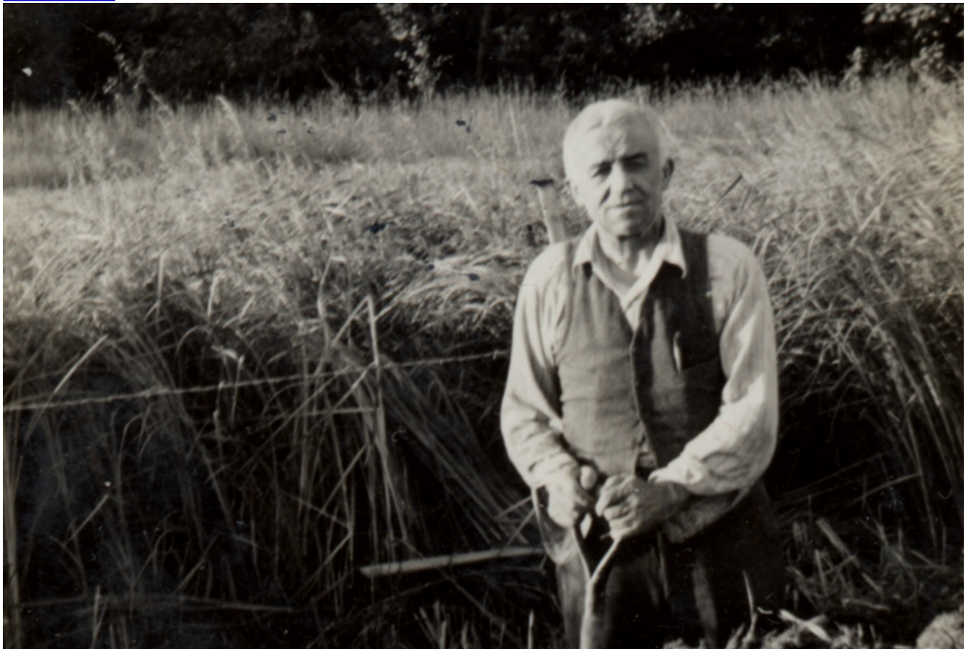
Catholic Worker co-founder Peter Maurin at St. Isidore's Farm in Aitkin, Minnesota, in 1941