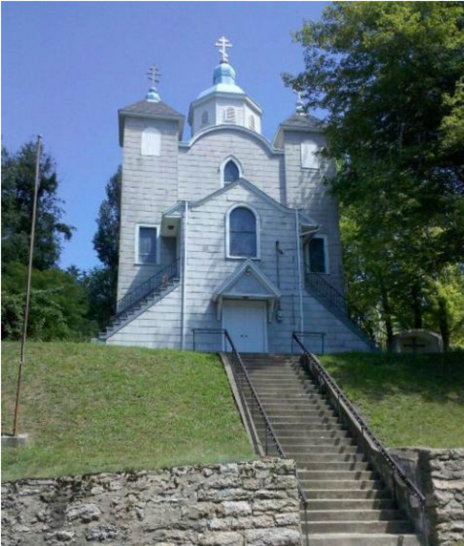
Assumption of the Blessed Virgin Mary Ukrainian Greek-Catholic Church in Centralia, Pennsylvania