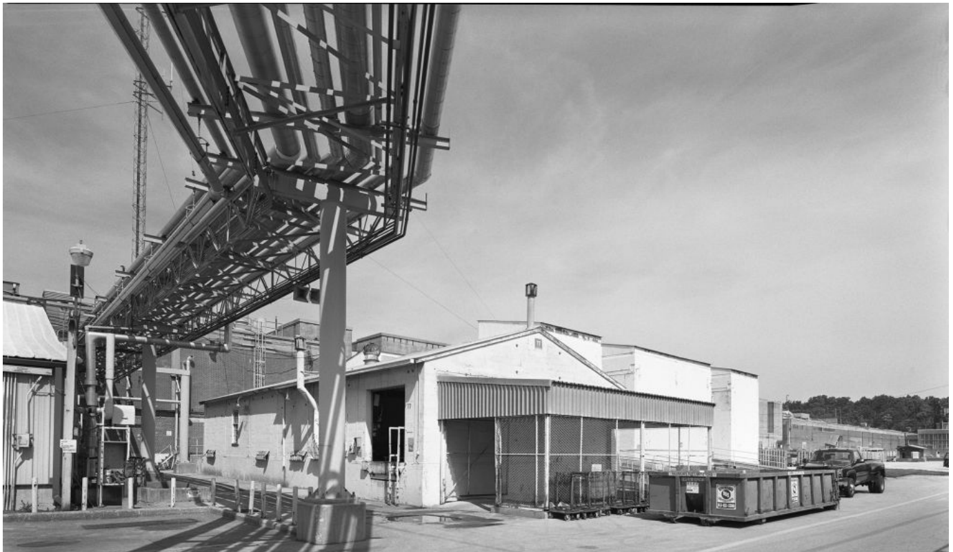
Fuel lines seen at the old Kansas City Plant in 2013

It was a double win for South Kansas City and Breslin. As a federally owned property, Bannister had remained tax exempt for nearly 70 years. Property tax assessors for Jackson County determined the federal complex had "no value" prior to transfer due to its aging structures and known environmental conditions. Once remediated, the leased industrial site could bring in $10 million a year, according to one research estimate.