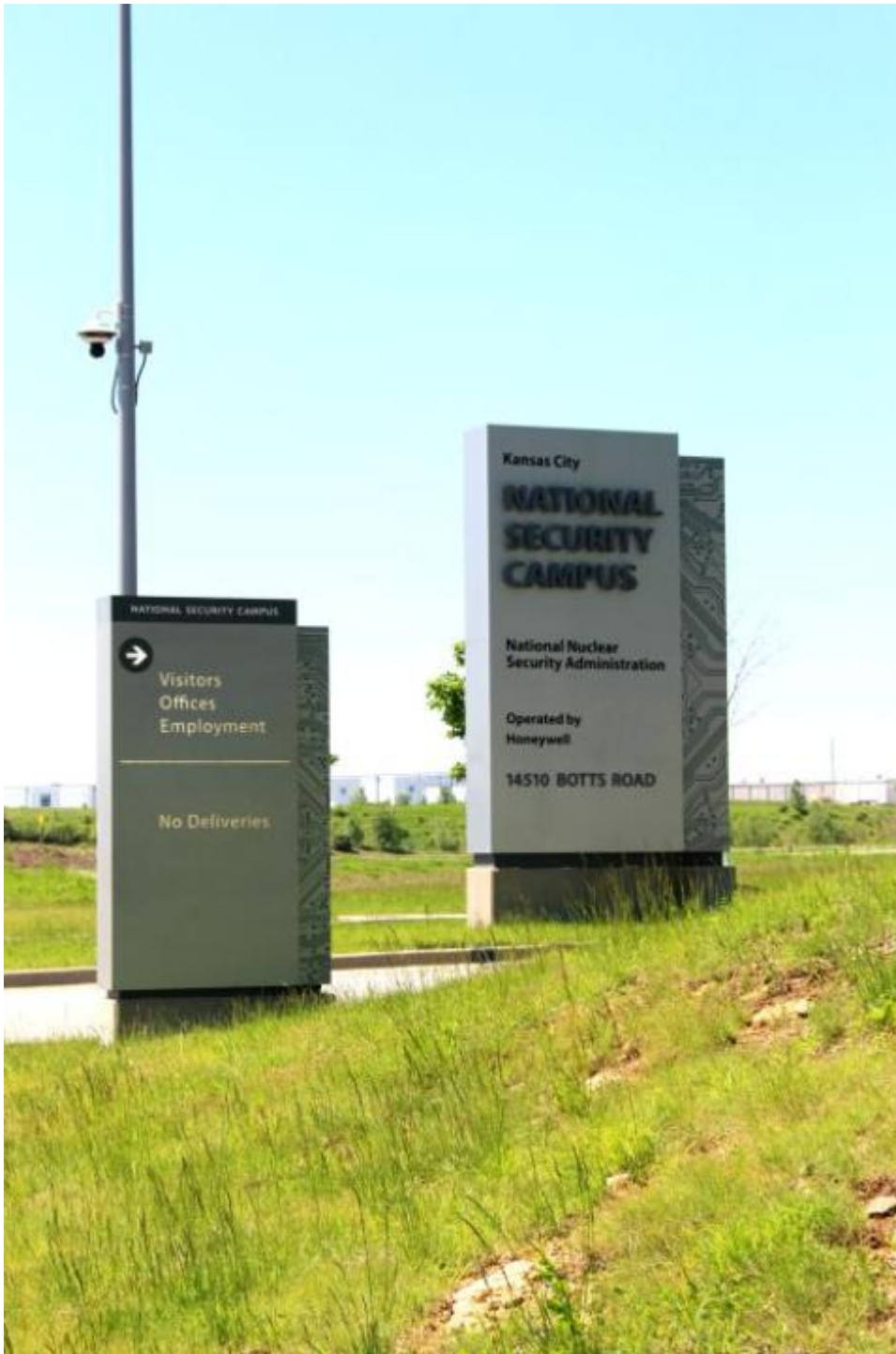
Entrance to Kansas City National Security Campus, 14520 Botts Rd., Kansas City, Missouri

Business is booming at the new Kansas City Plant, or Kansas City National Security Campus, as it is now called, on Botts Road in South Kansas City. The Trump administration's 2020 budget request for the operation is close to $1 billion — an