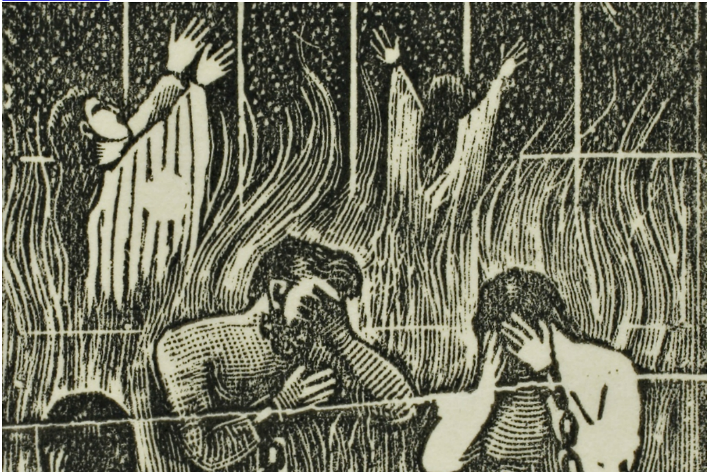
"Souls in Purgatory," detail, by José Guadalupe Posada, Mexican, 1871-1913 (Art Institute of Chicago)