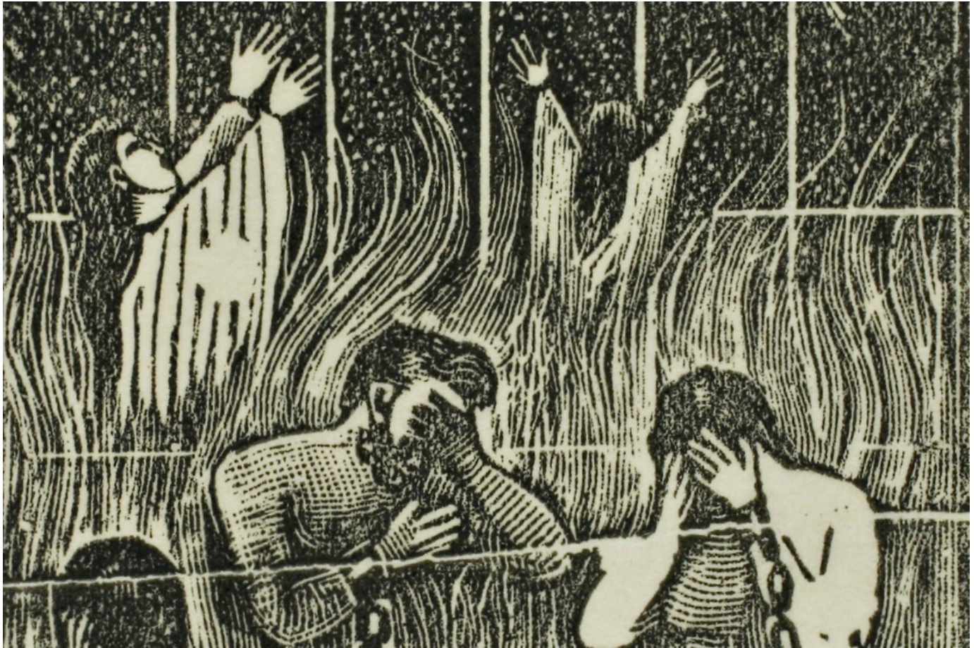
"Souls in Purgatory," detail, by José Guadalupe Posada, Mexican, 1871-1913