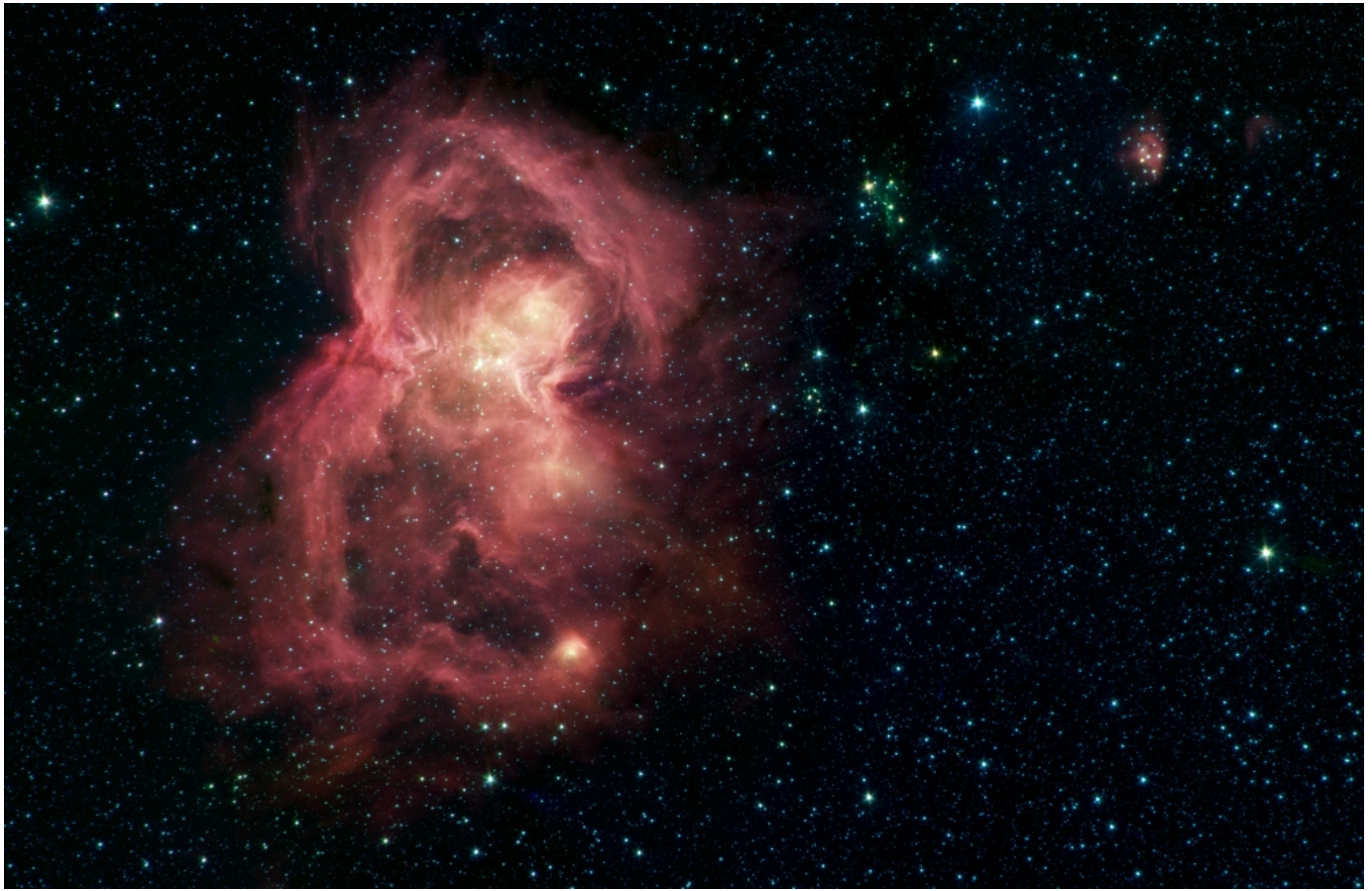
Infrared image from NASA's Spitzer Space Telescope of the W40 nebula — a giant cloud of gas and dust in space where new stars may form

not exist in Space. Top heavy and top-down hierarchies searched for new designs as the liberation of information also eliminated the staple of hierarchy of mid-level mediation between executive and worker.