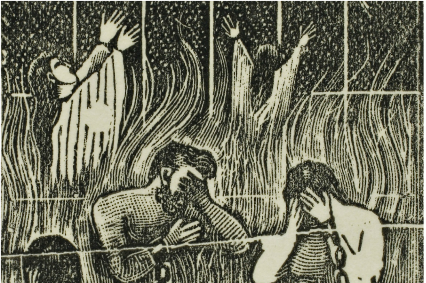
"Souls in Purgatory," detail, by José Guadalupe Posada, Mexican, 1871-1913 (Art Institute of Chicago)