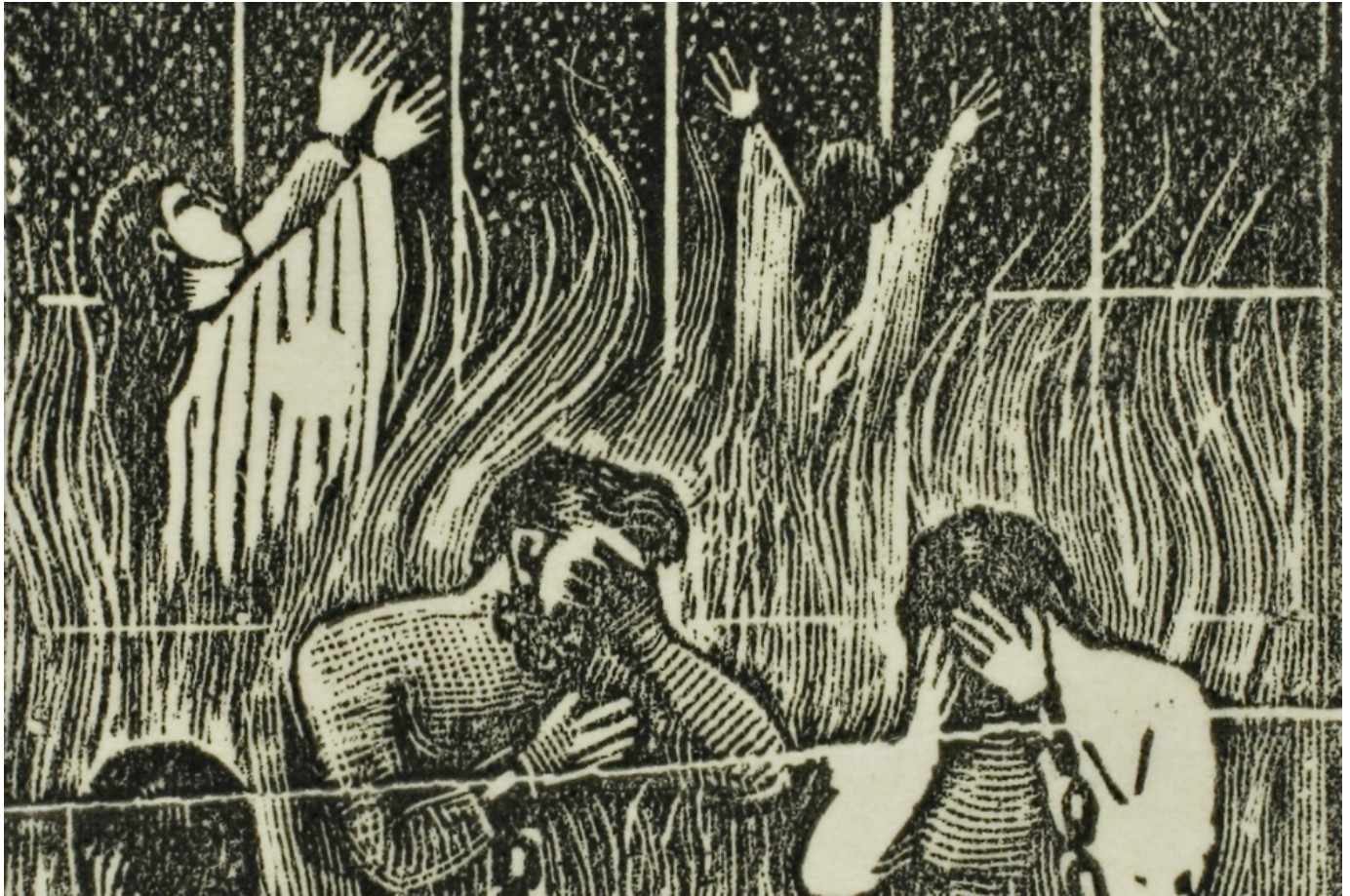
"Souls in Purgatory," detail, by José Guadalupe Posada, Mexican, 1871-1913 (Art Institute of Chicago)