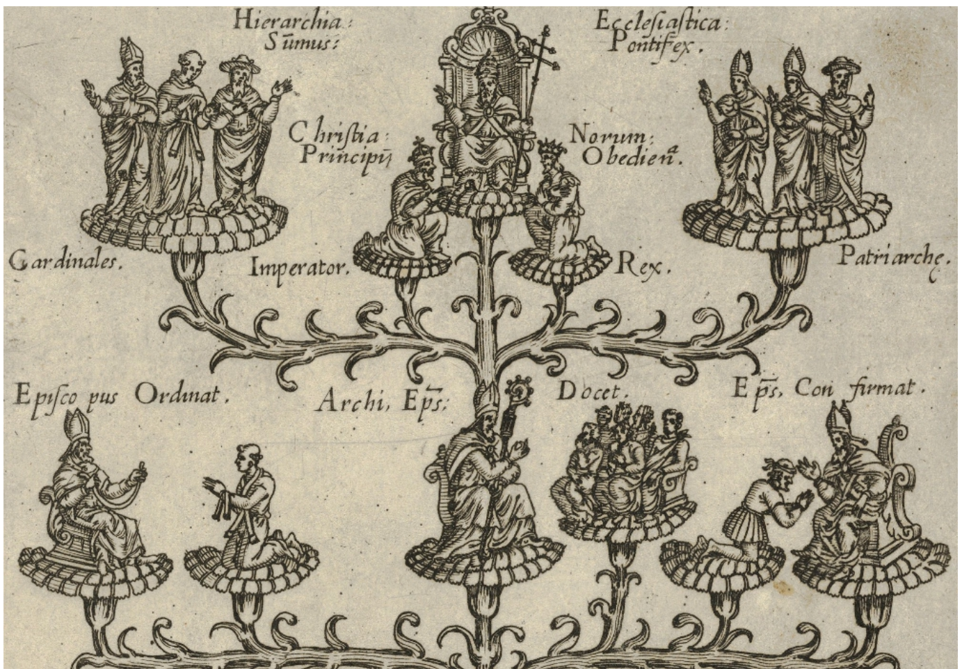
The hierarchy of the church in the form of a tree, a plate from a book, detail from the upper half, circa 1550-1650

Those who have presided at the top of the Church still do not fully grasp that this great hulking caravan, as ponderous, spuriously colorful, and outdated as a circus, no longer draws crowds to its parades and processions. In contrast to the buckling and emptying hierarchical church structures, store front churches, even in traditionally Catholic countries, are multiplying like biblical loaves because they are free of the crushing weight of hierarchical forms and free of the catalog of possessions that go along with them. The rise of store front churches is a function not of the far-sighted but of the near-sighted bureaucrats who cannot see that failing hierarchy is crushing them beneath its weight.