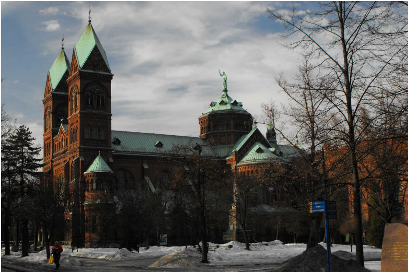
Franciscan monastery in Katowice Panewniki, Poland, 2010

The church's harshest opponents will go on fighting against it, whatever it does to assuage criticisms, while the church's most diehard supporters will go on defending it through thick and thin.