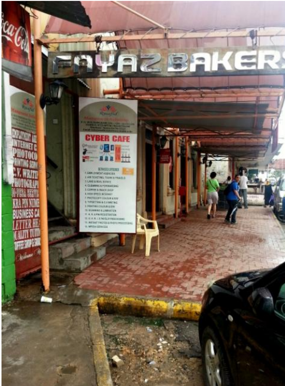
A cyber café is seen in Mombasa, Kenya, in 2013.