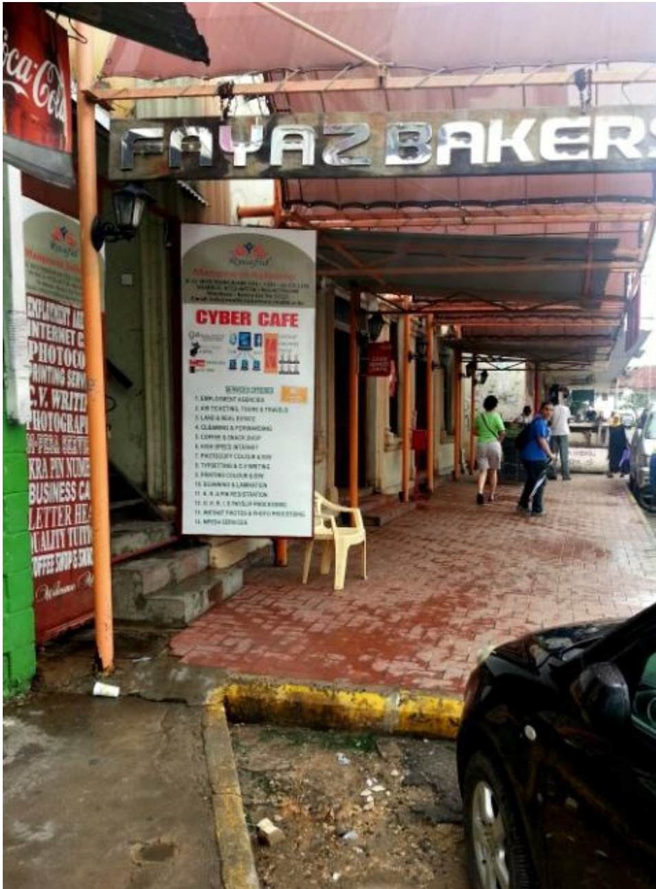
A cyber café is seen in Mombasa, Kenya, in 2013.