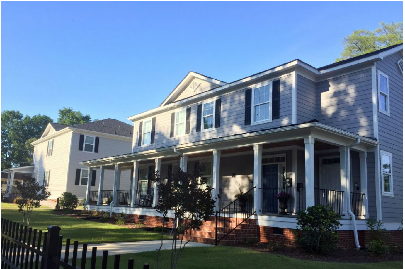
Two of the three Friendship House buildings in Fayetteville, North Carolina

His signature creation was L'Arche, a worldwide network of homes where people with and without disabilities live and work as peers. The influence of L'Arche can be found in Friendship Houses, which have adopted Vanier's core principle of "Eat together, pray together, celebrate together."