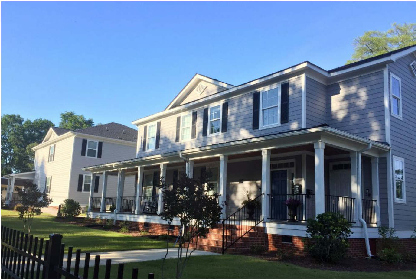
Two of the three Friendship House buildings in Fayetteville, North Carolina

His signature creation was L'Arche, a worldwide network of homes where people with and without disabilities live and work as peers. The influence of L'Arche can be found in Friendship Houses, which have adopted Vanier's core principle of "Eat together, pray together, celebrate together."