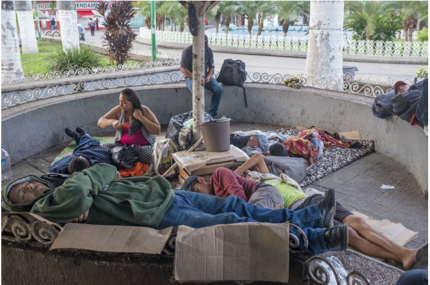
Migrants from Central America sleep in a kiosk in Tapachula, Mexico, May 24.