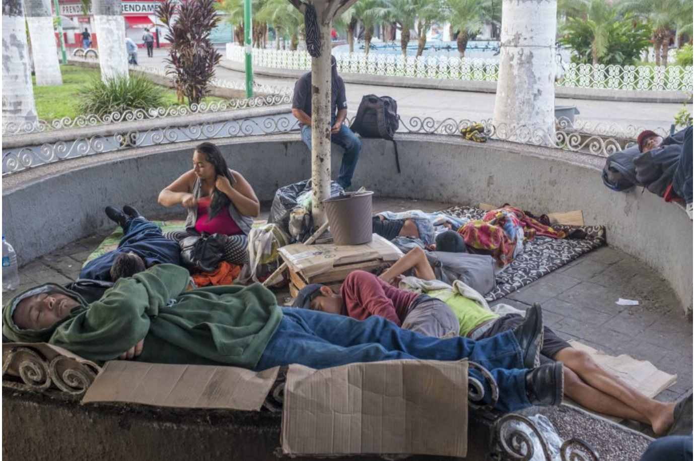
Migrants from Central America sleep in a kiosk in Tapachula, Mexico, May 24.