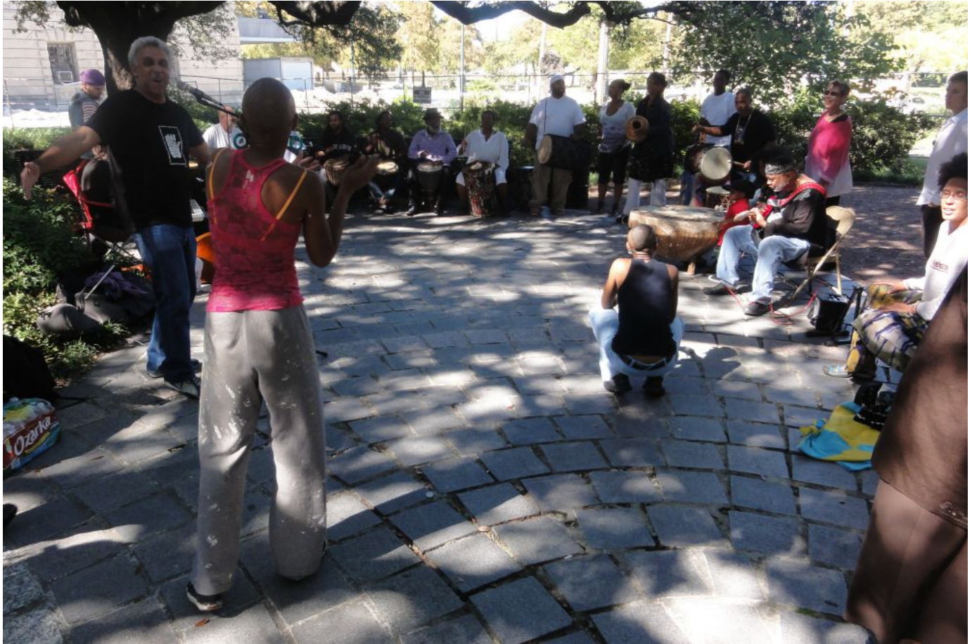
People drum and dance in Congo Square, New Orleans, October 2011.