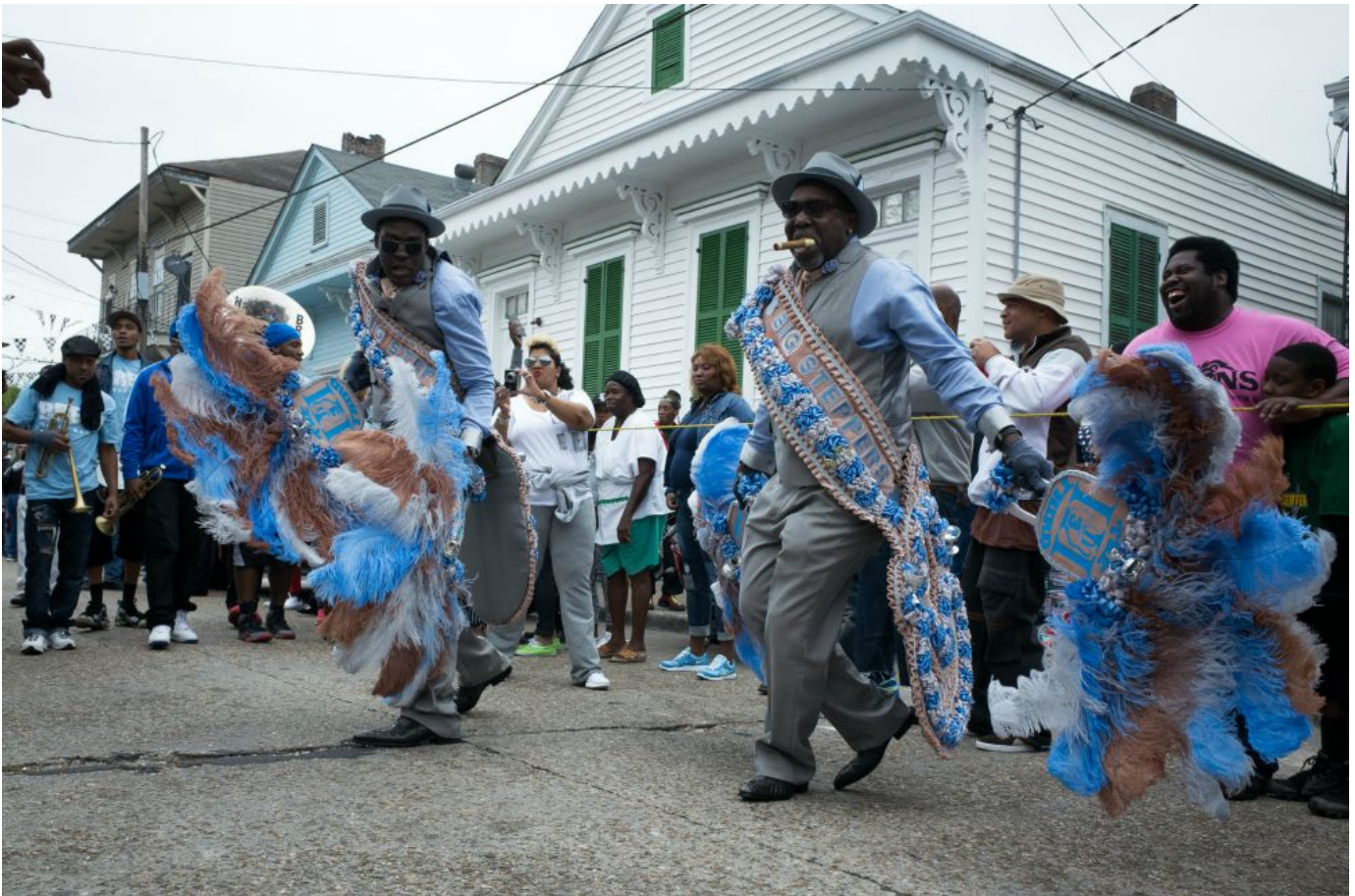
A 2015 Second Line parade in New Orleans

And while slave owners and priests relied heavily upon punishment to enforce slavery, they also allowed slaves to carry their own weapons, be entrepreneurial, work their own gardens, and to hunt, fish, trap and gather fruit to avoid the constant threat of famine. The place we now call Congo Square originally served as a marketplace where African peoples also "used the land to dramatize their past, resurrecting burial choreographies of the mother culture."