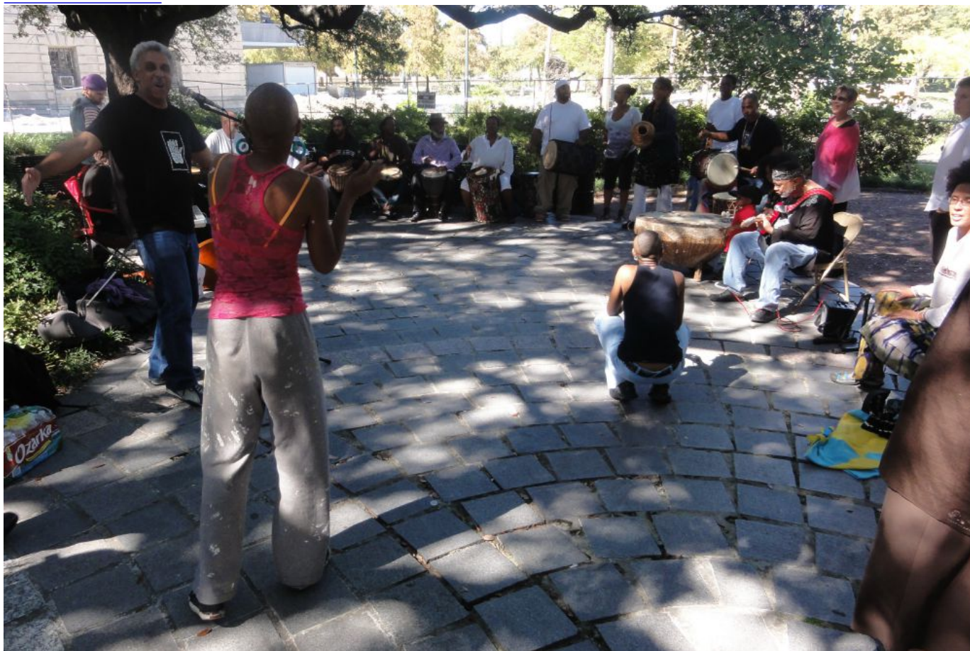
People drum and dance in Congo Square, New Orleans, October 2011.