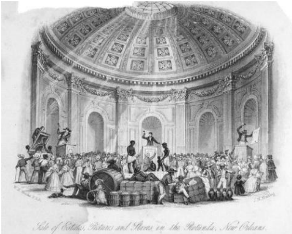
Etching depicting "Sale of Estates, Pictures and Slaves in the Rotunda, New Orleans," 1853

New Orleanians perfected the art of parades over centuries. Funerals with military bands were commonplace as early as the memorial for King Carlos of Spain in 1789. Berry illustrates the initiation of carnival parades in 1857 and how Reconstruction-era Mardi Gras parades featured costumes "with scalding, often racist satire," often mocking Union generals and Northern "carpetbaggers."