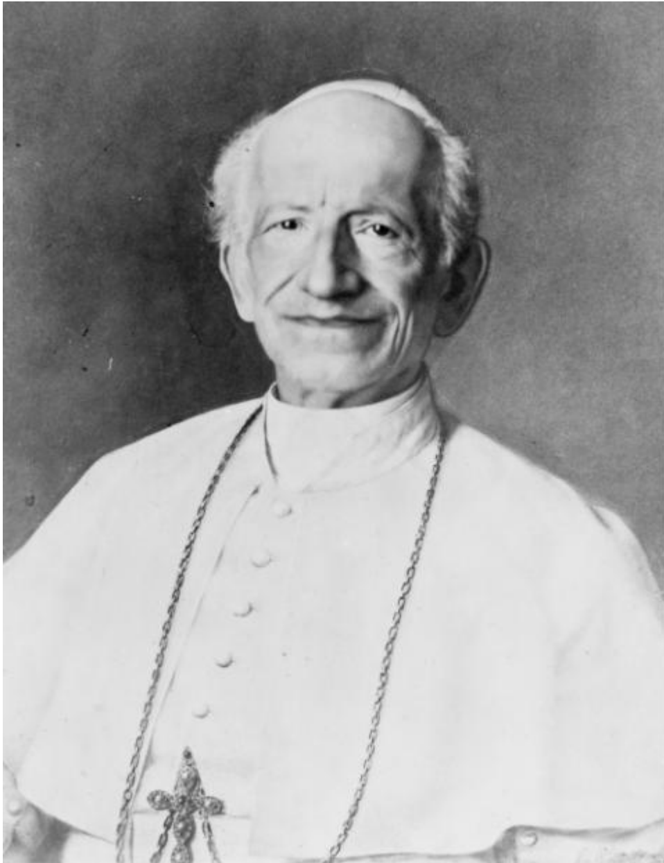
Pope Leo XIII

Even before John XXIII, popes were grappling with new communications technology in this way. Pius XII dedicated an encyclical, Miranda Prorsus , to movies, radio and TV in 1957. And Pius XI plunged the church directly into broadcast media with the founding of Vatican Radio in 1931.