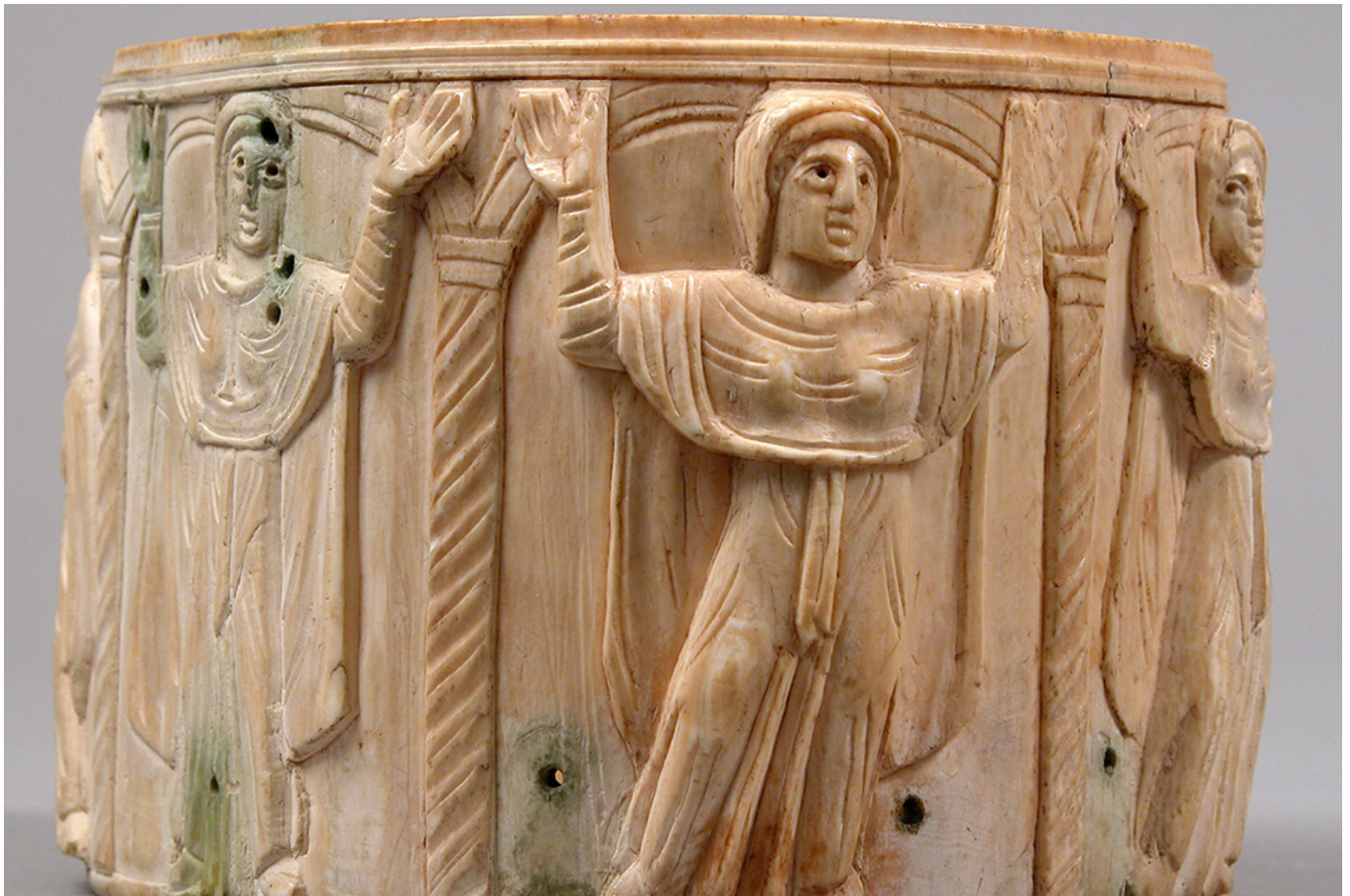
"Pyx with the Women at Christ's Tomb," ivory pyx, circa A.D. 500s, made in Eastern Mediterranean (Metropolitan Museum of Art)

Kateusz believes that the images are significant because they show women and men in parallel roles, their bodies and gestures mirroring one another, and she suggests that this parallelism is indicative of their equality in their liturgical roles.