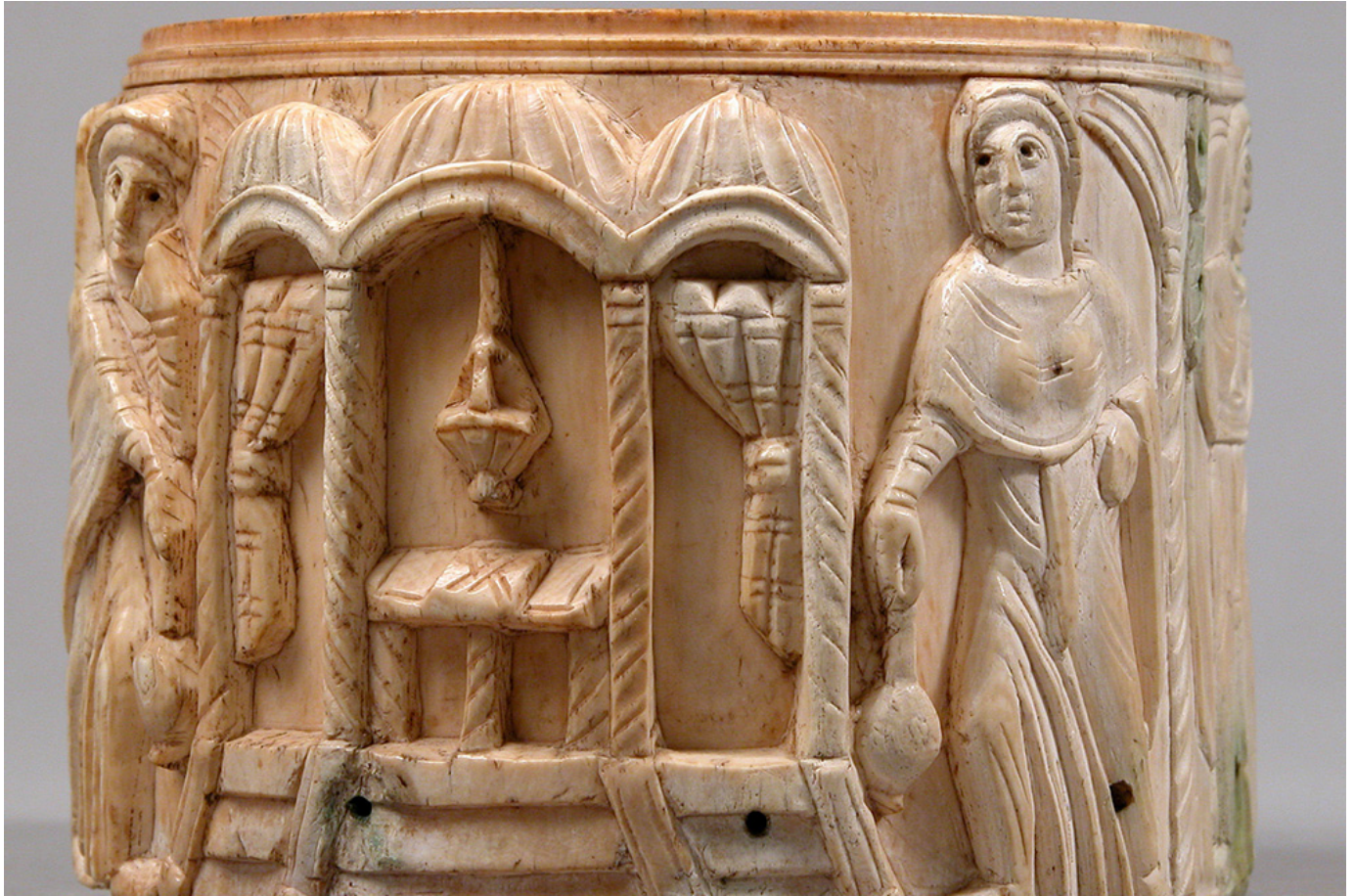
"Pyx with the Women at Christ's Tomb," ivory pyx, circa A.D. 500s, made in Eastern Mediterranean

Virtually no liturgical manuscripts survived from the first seven centuries of Christianity in relation to ordination, lending to a long gap in the historical record. The oldest manuscript describing ordination in the Roman rite, the Ordo Romano , dates from the ninth century, centuries after these three artifacts.