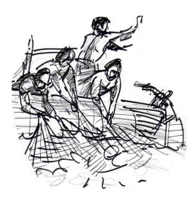
"Does your teacher pay the temple tax?" (Matt 17:23).

The composition of the Gospels has some similarity to one of Jesus' parables about fishing with a dragnet (Matt 13:47-52). The evangelists pulled together the many sayings and stories of Jesus from the oral and preaching traditions and organized them within their narratives to convey who Jesus was and what he had taught. These compositions were structured with theological purpose and literary skill to form readers in the faith and to inspire them to enter the mystery of Jesus' life, death and resurrection as a living process of transformation.