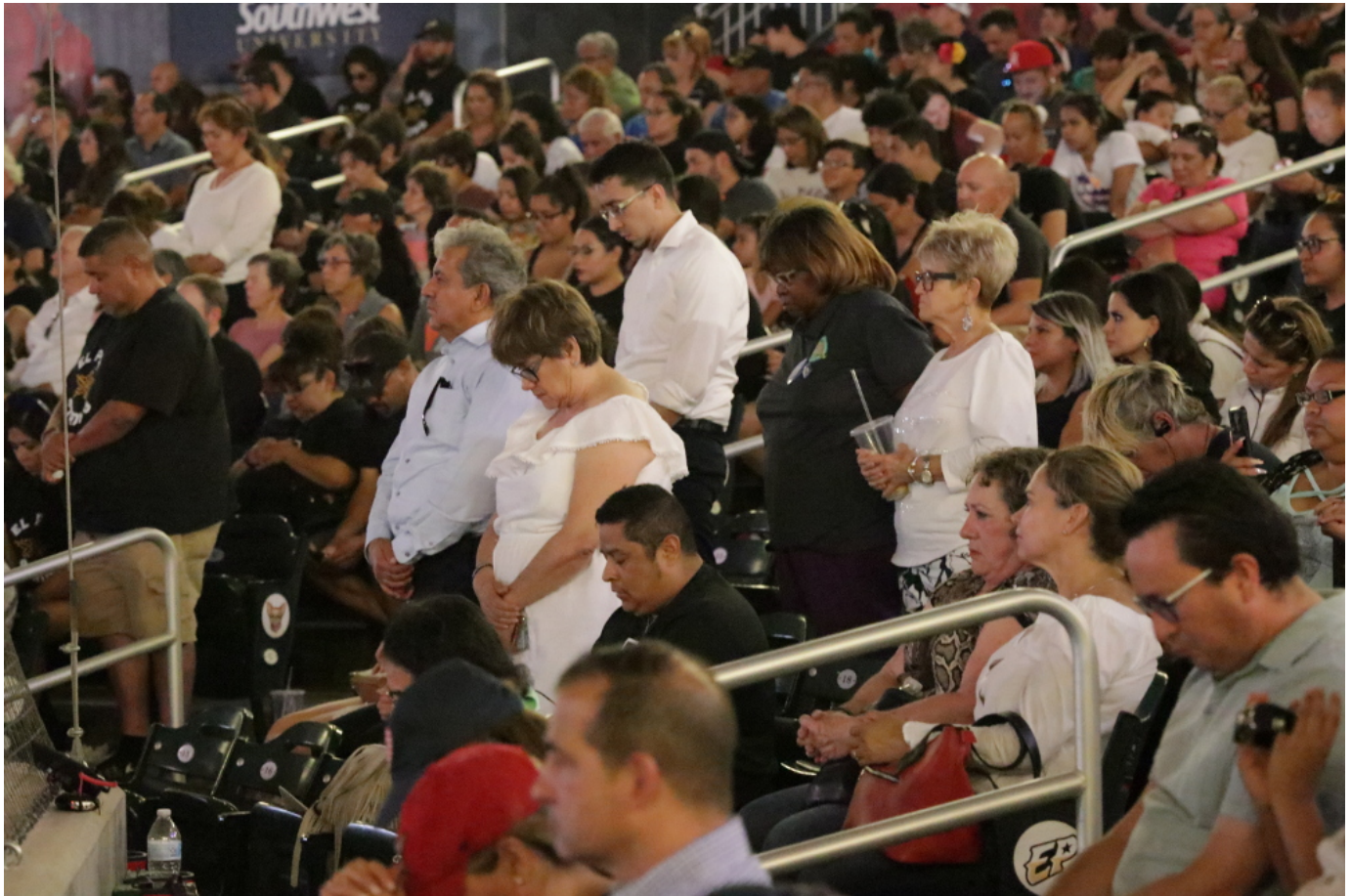
Participants bow their heads in prayer at an Aug. 14 memorial held at Southwest University Park in El Paso.

"I've seen over the years as we've reached out to waves of migrants that come through El Paso, how there is a tremendous spring of solidarity to draw upon in this community," he said. "The effort to get volunteers and donations to help us receive migrating people with dignity is not especially difficult here. What El Paso is dealing with now in terms of migrants, solar energy, and water consumption is what most communities will be dealing with in coming years. The response is something to emulate."