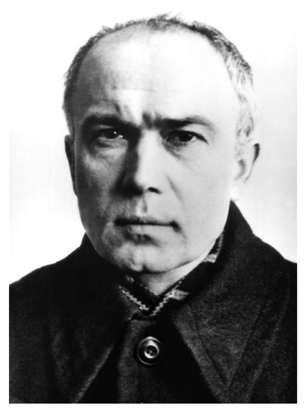
Father Maximilian Kolbe is pictured in an undated black-and-white file photo.

"All wars have direct and indirect consequences," said Schick. "The direct consequences are the deaths of soldiers and civilians, destruction of cities, villages and entire regions. Thus many human relationships are shattered and many souls are wounded."