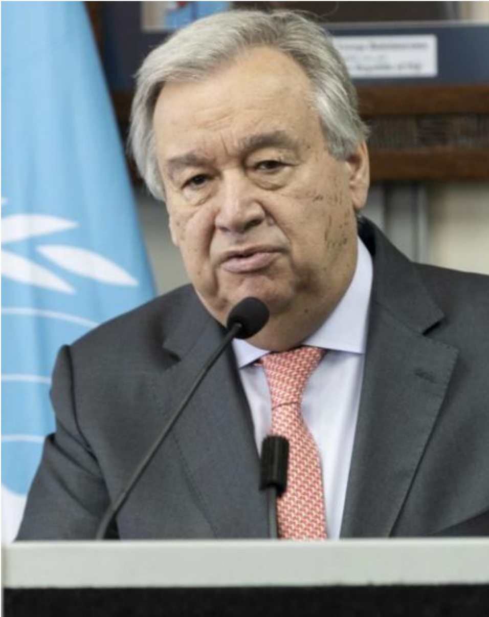
United Nations Secretary-General António Guterres

In addition to the nearly 14,000 nuclear weapons in the world, countries possessing such weapons "have well-funded, long-term plans to modernize their nuclear arsenals. More than half of the world's population still lives in countries that either have such weapons or are members of nuclear alliances."