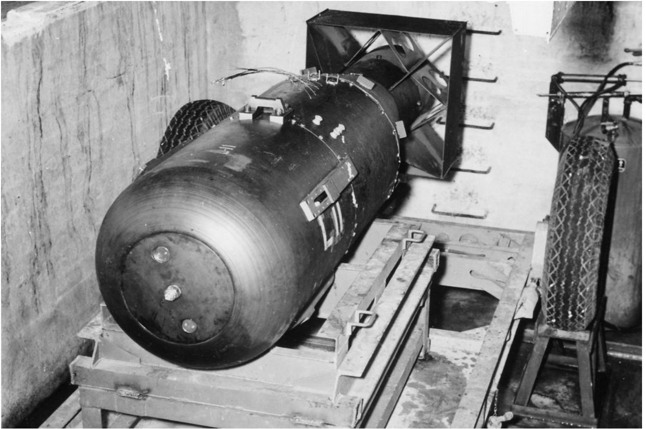
"Little Boy" unit on trailer cradle in pit on Tinian Island, Commonwealth of Northern Mariana, before being loaded into Enola Gay's bomb bay, August 1945