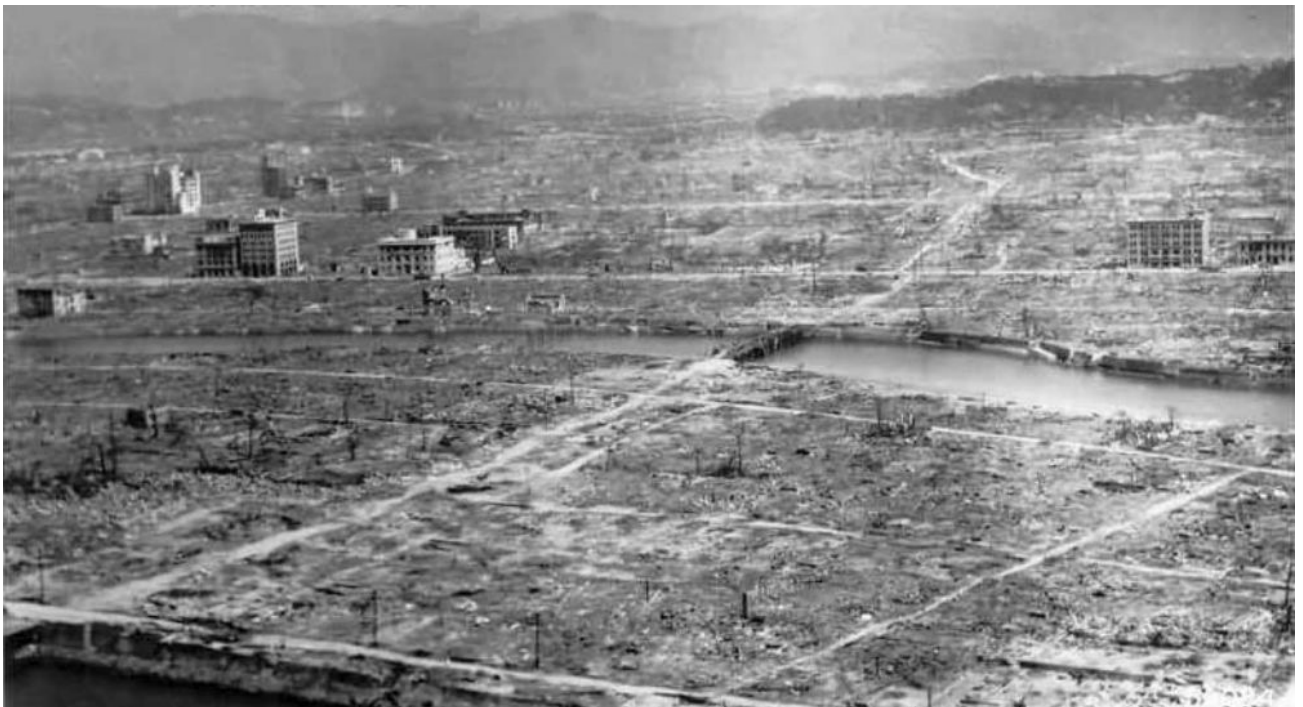
Hiroshima, Japan, Aug. 6, 1945