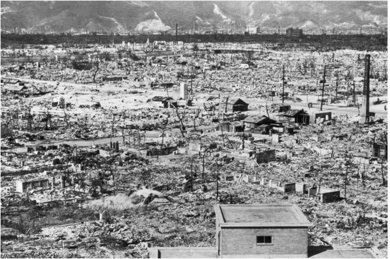
View from Red Cross Hospital, Hiroshima, Japan, after atomic bombing, 1945