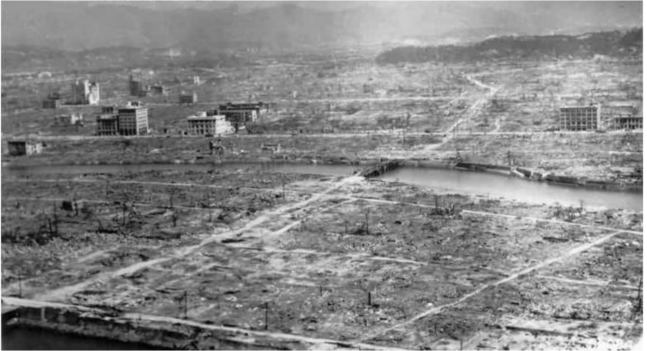
Hiroshima, Japan, Aug. 6, 1945