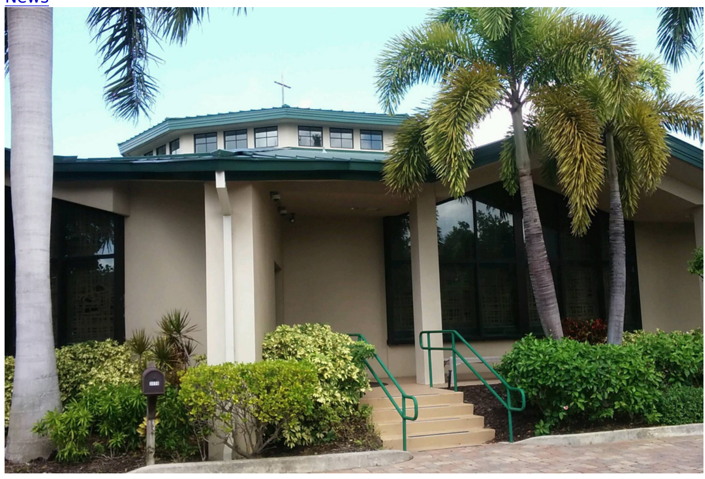
St. Isabel Church in Sanibel Island, Florida