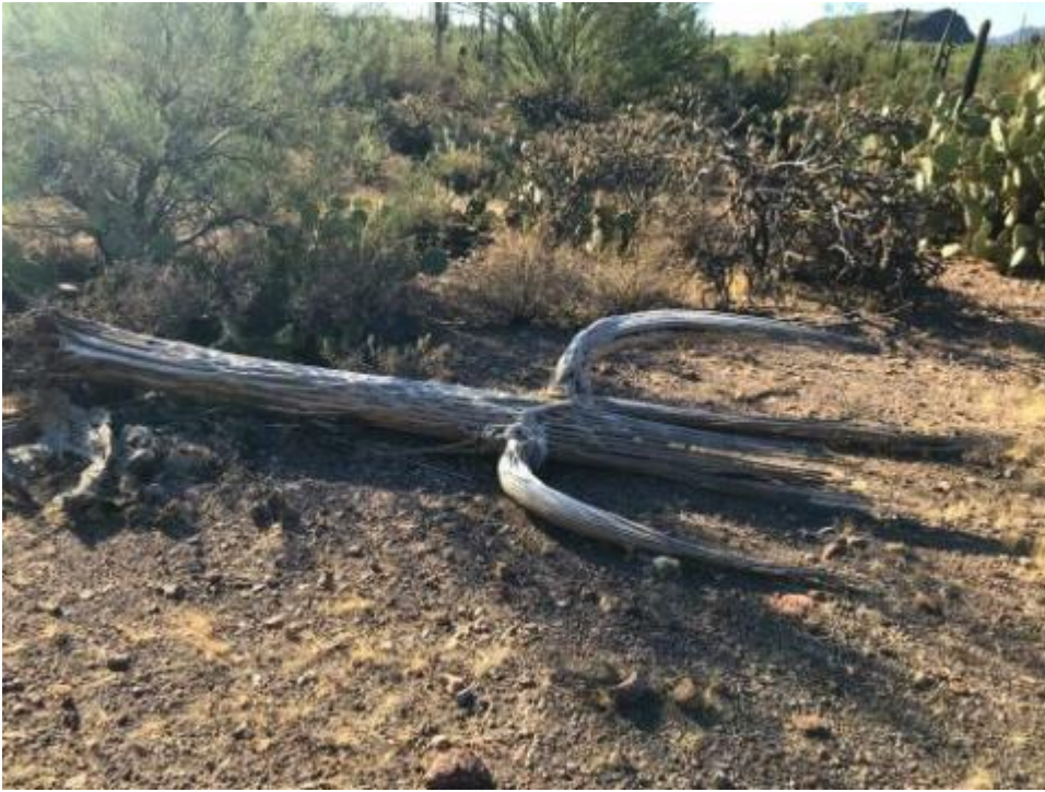
The fibrous skeleton of a dead saguaro cactus

On day three, I decided to touch a saguaro, which felt to me like a heroic act. I got close enough to find a break in the spines where I could touch the green skin without fear of losing my hand. I put my fingers on the leathery flesh. It felt surprisingly substantial, smooth and safe. I loved the sturdy feel of it, and took it in with the comfort I would a maple tree back home in Indiana. When I leaned on the saguaro, it didn't topple over, the way for some reason I had imagined it might. In this moment a kinship began: I wanted to learn as much as I could about these towering, sturdy, hollow, spiky creatures.