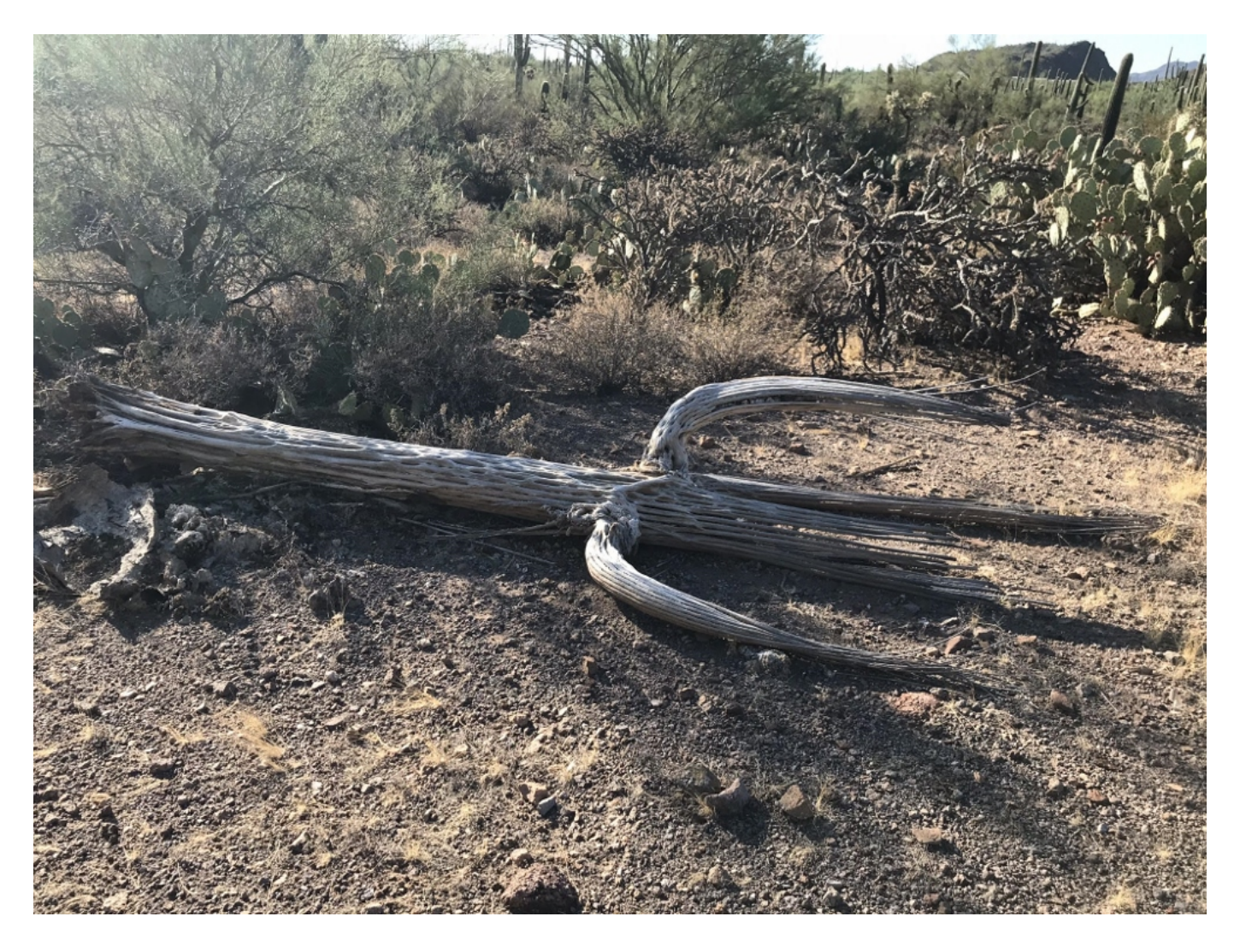
The fibrous skeleton of a dead saguaro cactus

On day three, I decided to touch a saguaro, which felt to me like a heroic act. I got close enough to find a break in the spines where I could touch the green skin without fear of losing my hand. I put my fingers on the leathery flesh. It felt surprisingly substantial, smooth and safe. I loved the sturdy feel of it, and took it in with the comfort I would a maple tree back home in Indiana. When I leaned on the saguaro, it didn't topple over, the way for some reason I had imagined it might. In this moment, a kinship began: I wanted to learn as much as I could about these towering, sturdy, hollow, spiky creatures.