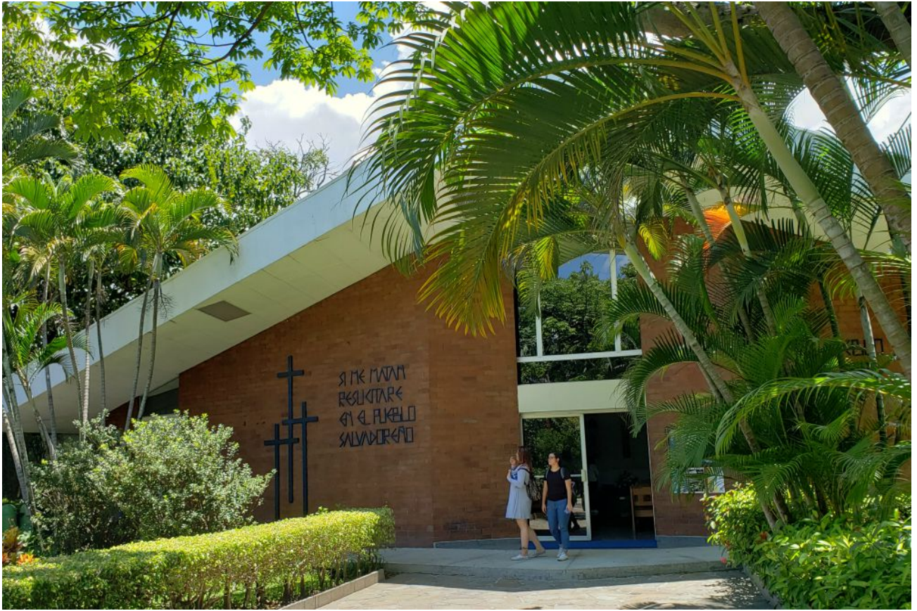
The campus chapel at the University of Central America in El Salvador, commonly known by the acronym UCA