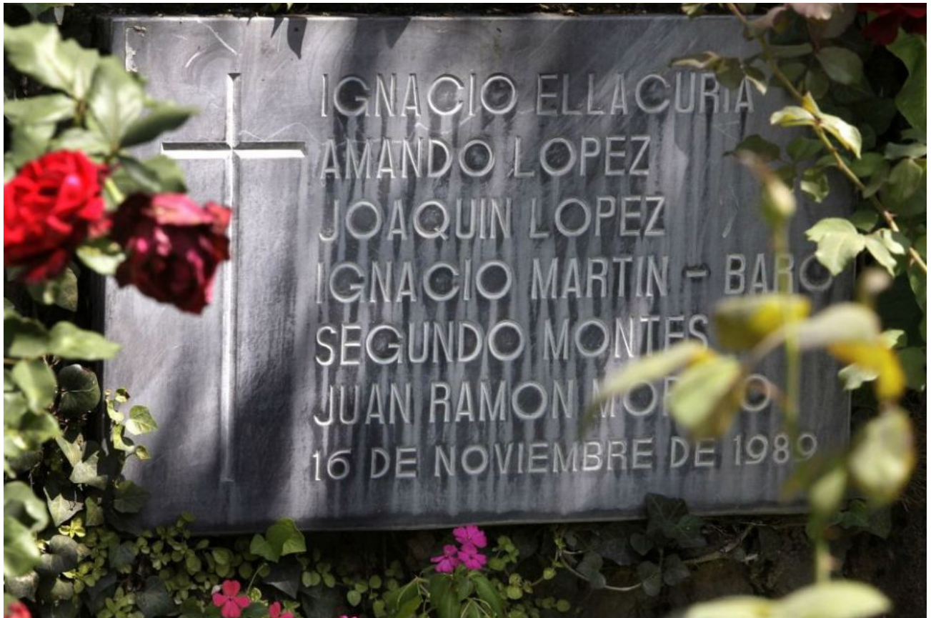
A stone bearing the names of six Jesuits massacred in 1989 is seen at Central American University in San Salvador, El Salvador, Nov. 16, 2009, the 20th anniversary of their deaths.