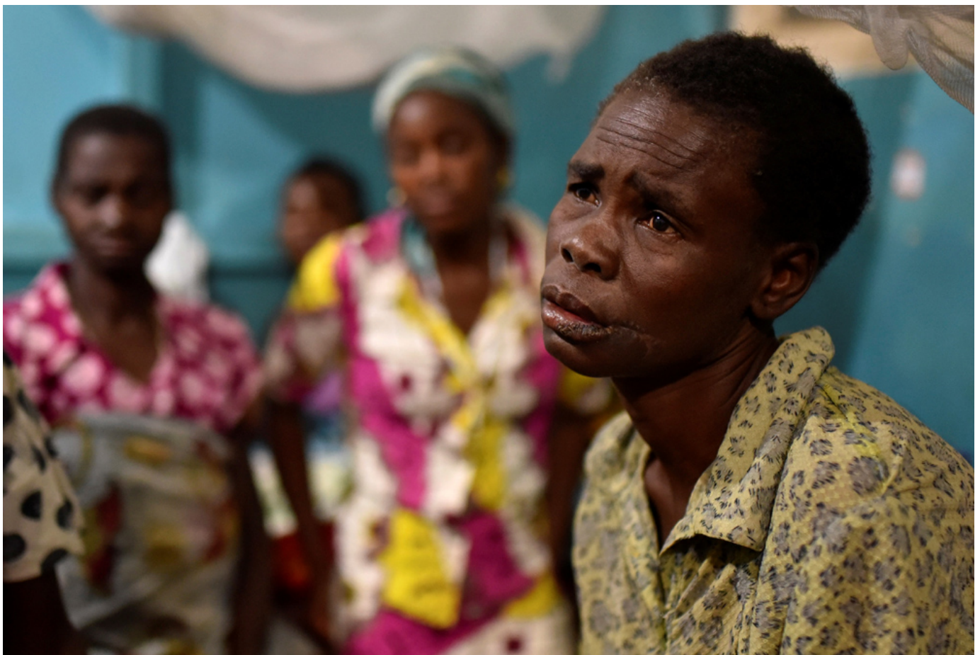
A victim of ethnic violence rests inside a hospital on June 25 in Bunia, Congo.

"We do have the opportunity to do [go to detention centers]. But the centers are at very high capacity. And there are a lot of people with so many needs. Even asylum claimers are in detention, which shouldn't be like that, but that's the policy," she said.