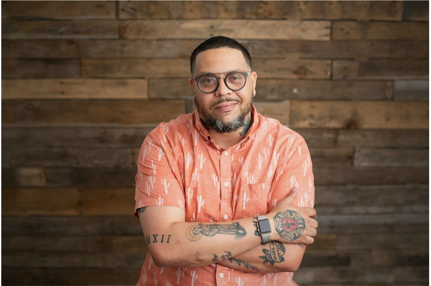
Lenny Duncan