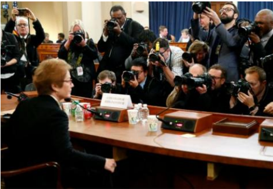
Marie Yovanovitch, former U.S. ambassador to Ukraine, testifies Nov. 15 in Washington before a House Intelligence Committee hearing as part of the impeachment inquiry into President Donald Trump.

As morally repugnant as Trump's pardons were, they were matched in ethical grotesqueness by his attacks on lifelong patriots who have served this country in a variety of challenging circumstances.