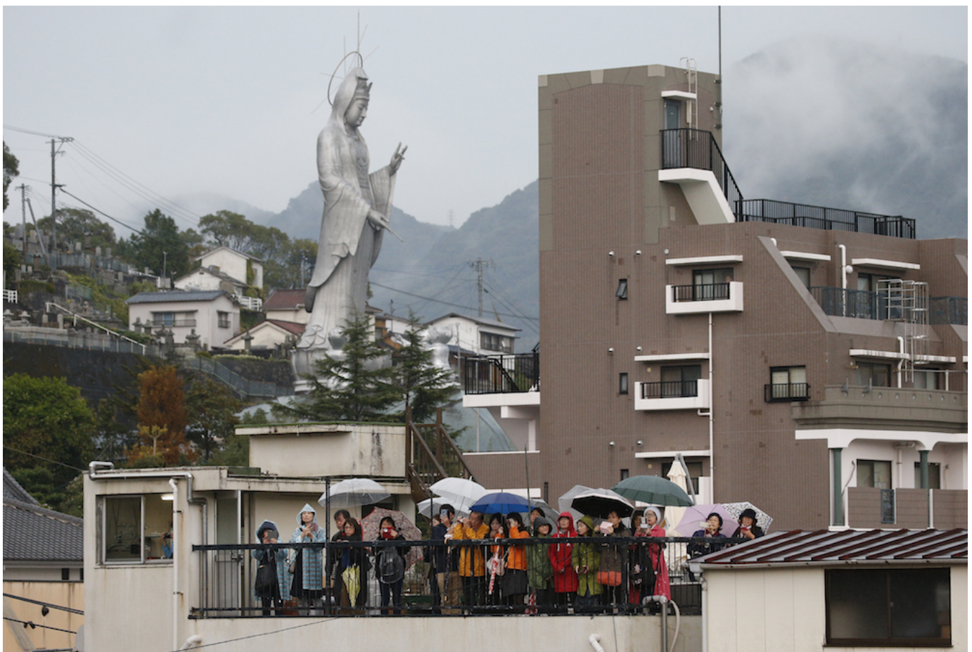
People watch during Pope Francis' visit to the martyrs' monument on Nishizaka Hill in Nagasaki, Japan, Nov. 24.

Visiting the city Nov. 24, Pope Francis paused for prayer on the hill where St. Paul Miki and 25 others were crucified in 1597; hundreds more were killed in the decades that followed. For more than 200 years there was not a single Catholic priest in Japan, but small communities of "hidden Christians" kept Catholicism alive by secretly baptizing their children and teaching them the faith.