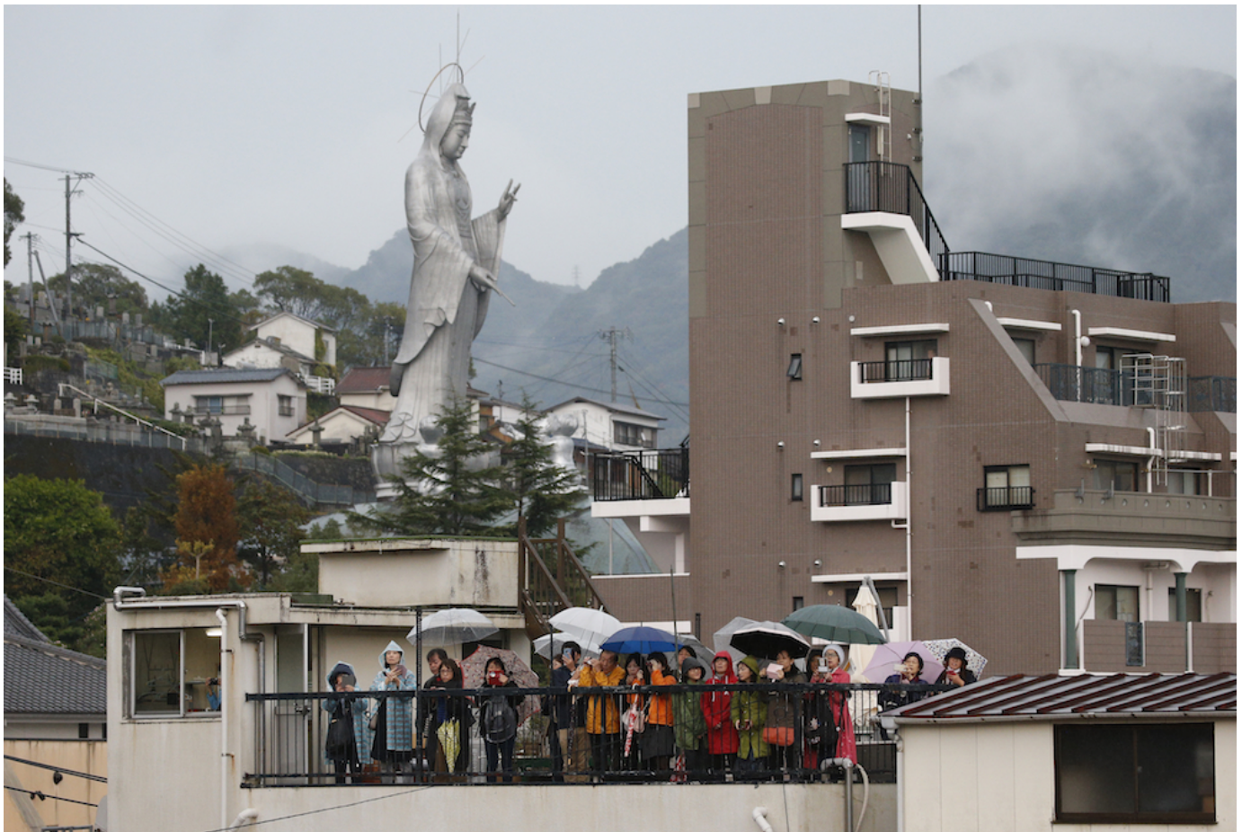
People watch during Pope Francis' visit to the martyrs' monument on Nishizaka Hill in Nagasaki, Japan, Nov. 24.

Visiting the city Nov. 24, Pope Francis paused for prayer on the hill where St. Paul Miki and 25 others were crucified in 1597; hundreds more were killed in the decades that followed. For more than 200 years there was not a single Catholic priest in Japan, but small communities of "hidden Christians" kept Catholicism alive by secretly baptizing their children and teaching them the faith.