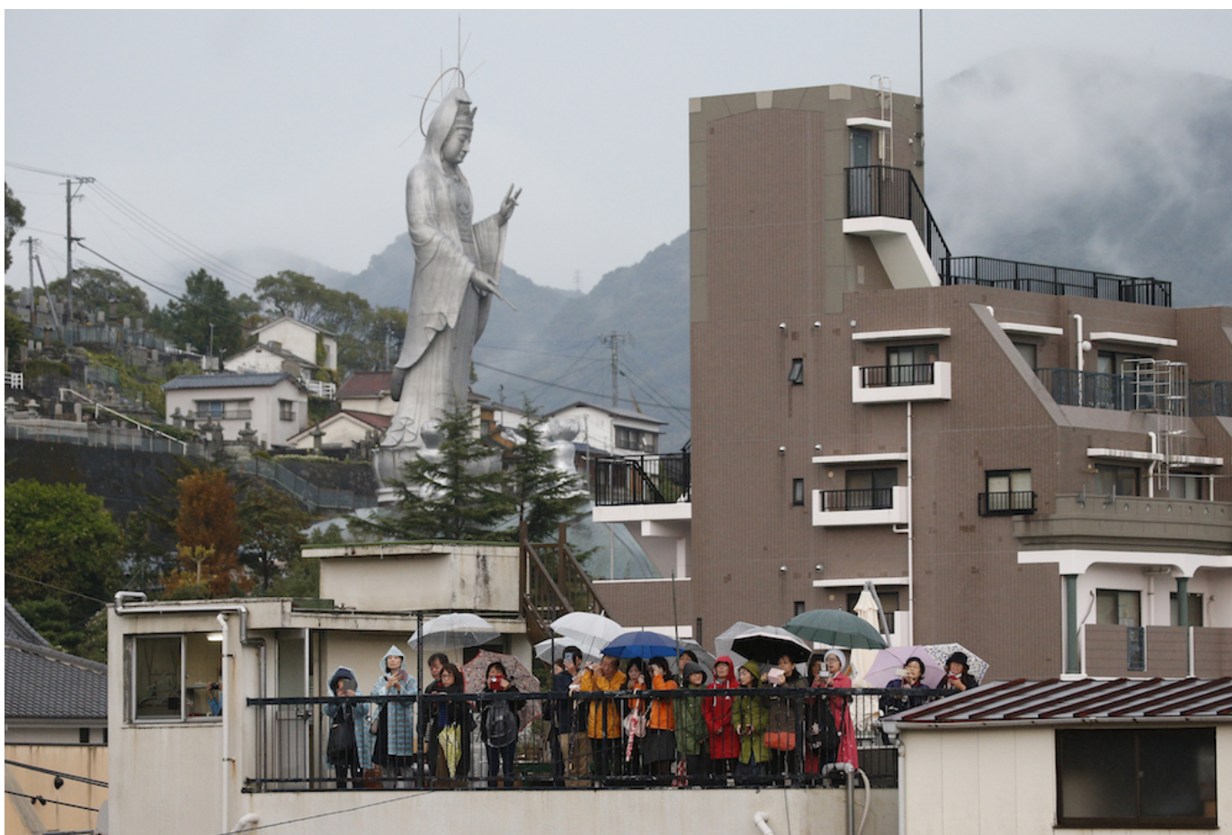
People watch during Pope Francis' visit to the martyrs' monument on Nishizaka Hill in Nagasaki, Japan, Nov. 24.

Visiting the city Nov. 24, Pope Francis paused for prayer on the hill where St. Paul Miki and 25 others were crucified in 1597; hundreds more were killed in the decades that followed. For more than 200 years there was not a single Catholic priest in Japan, but small communities of "hidden Christians" kept Catholicism alive by secretly baptizing their children and teaching them the faith.