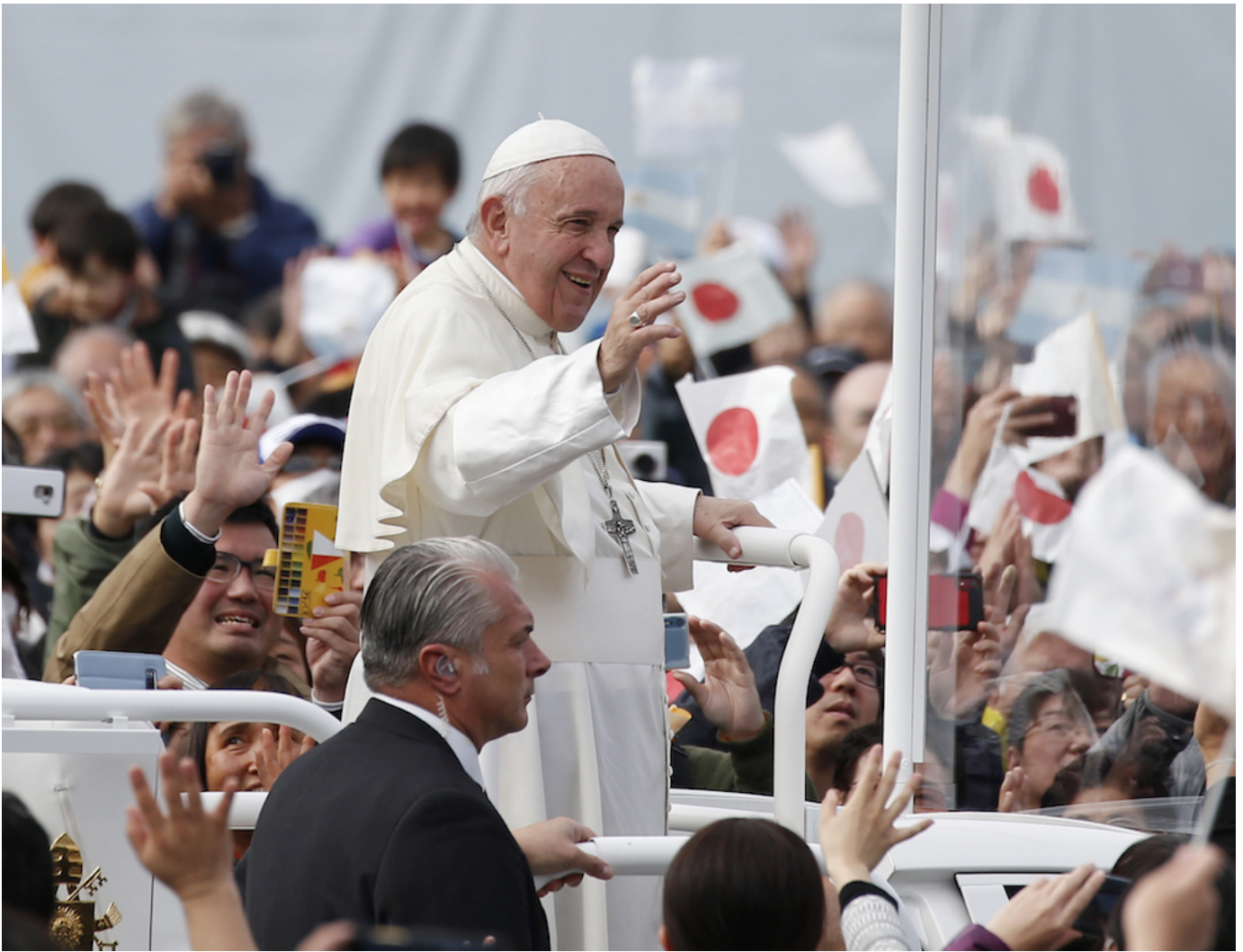
Pope Francis greets the crowd before celebrating Mass at the baseball stadium in Nagasaki, Japan, Nov. 24.

"This land has experienced, as few countries have, the destructive power of which we humans are capable," the pope said in his homily. "Nagasaki bears in its soul a wound difficult to heal, a scar born of the incomprehensible suffering endured by so many innocent victims of wars past and those of the present, when a third World War is being waged piecemeal."