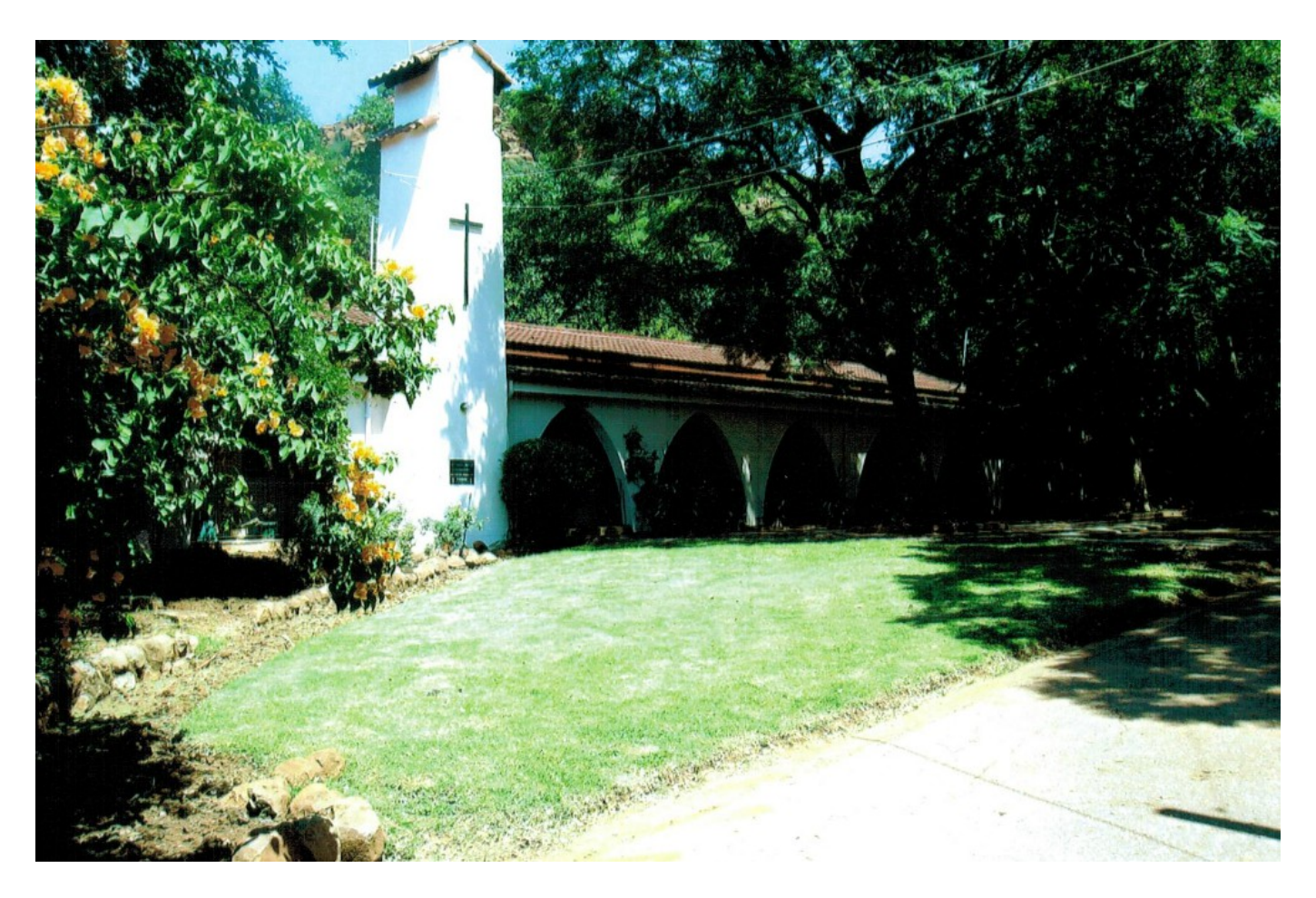
The Mercy convent in Mmakau

Almost ceremonially, I was embraced, hugged, squeezed and welcomed by each of the eight sisters. Entering the house, I saw a table set for lunch, with rolls, a bowl of potato salad, sliced chicken, potato chips and Coke. An old St. Bernard snored away in the corner.