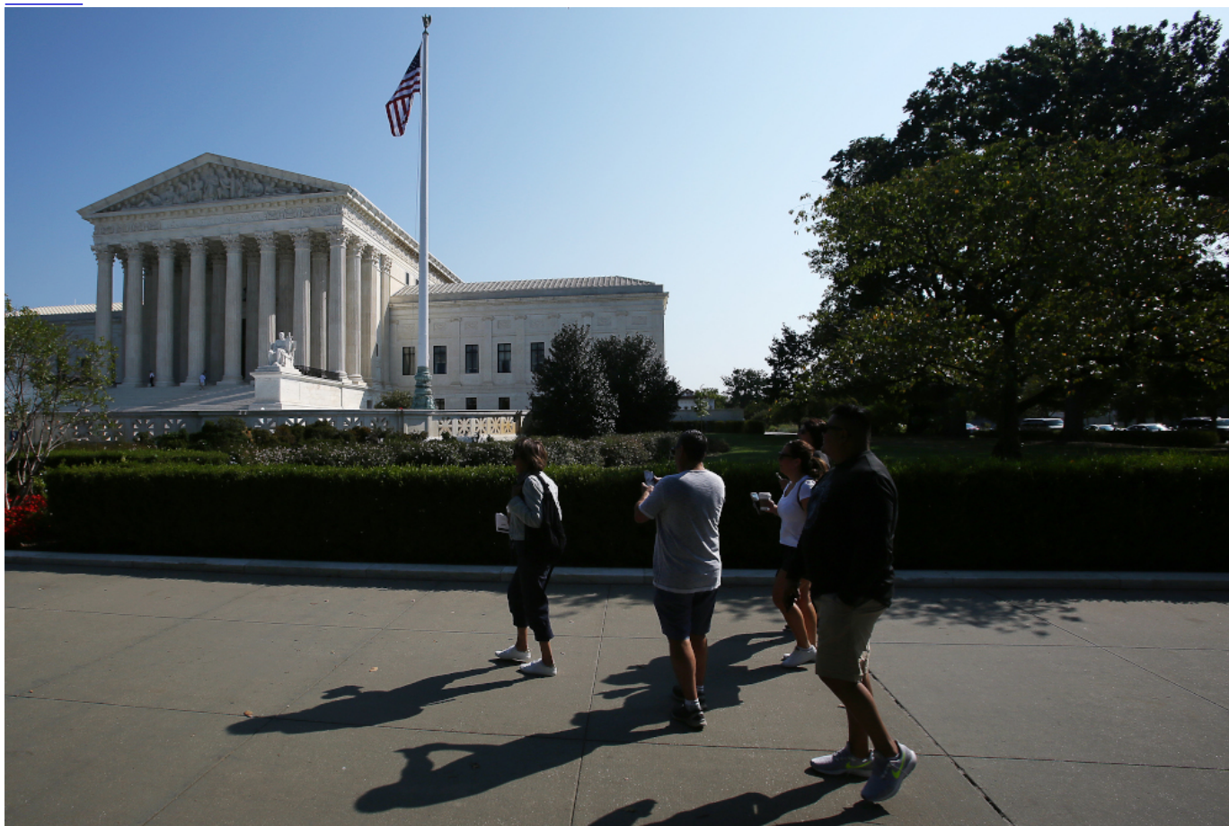
The U.S. Supreme Court is seen in Washington Oct. 1.